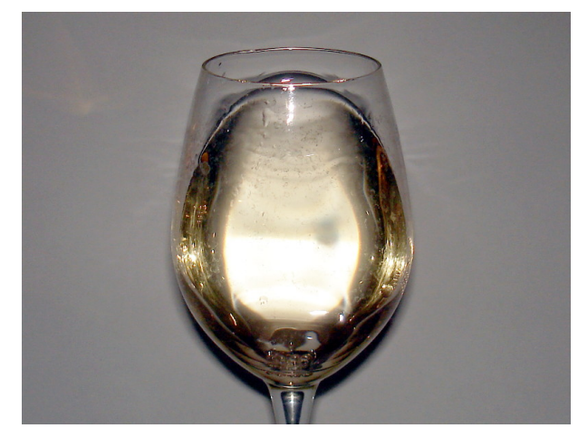
The color of Sauvignon Blanc: greenish yellow with nuances of the same color

a pretty wide variability. It should be said that, in most of the cases, it is preferred to keep and accentuate its typical crispness: for this reason it is very rare Sauvignon Blanc is fermented or aged in cask or barrique. Its acidity makes it very suited for the production of sweet wines, of which the most famous examples are Sauternes and Barsac, where it is sometimes used.