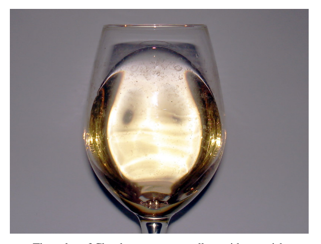
The color of Chardonnay: straw yellow with greenish yellow nuances

In areas having a mainly cool climate - such as Loire Valley, its preferred land - Sauvignon Blanc makes very crisp wines and characterized by an aromatic profile with evident vegetal nuances, box flower and bell pepper, in particular. In areas having a warmer climate, such as Italy, Sauvignon Blanc expresses an aromatic character made of exuberant tropical fruits, with no hint of its typical vegetal profile. Aging, as it can be easily understood, greatly affects the development of aromas and crispness, with