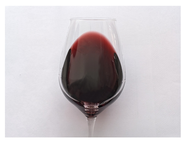
The color of Vino Nobile di Montepulciano

The wines we will examine in this month's tasting by contrast,