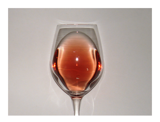
The color of Salento Rosato

The olfactory profiles of rosé wines, also because of the wine making techniques generally used for their production and which prefer the use of inert containers, are characterized by the fresh aromas of red pulp fruits and flowers. This characteristic is clearly perceptible both in Alto Adige Lagrein