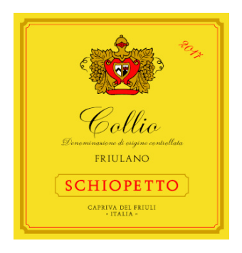
Collio Friulano 2017 Schiopetto (Friuli-Venezia Giulia, Italy)

Fish appetizers, Pasta with fish and crustaceans, Sauteed fish