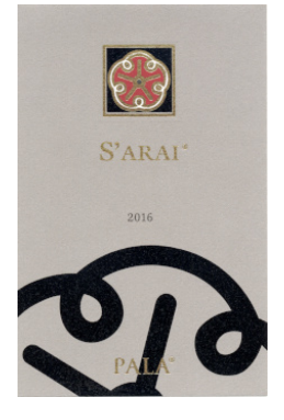
S'Arai 2016 Pala (Sardinia, Italy)

Broiled meat and barbecue, Roasted meat, Stewed meat, Hard