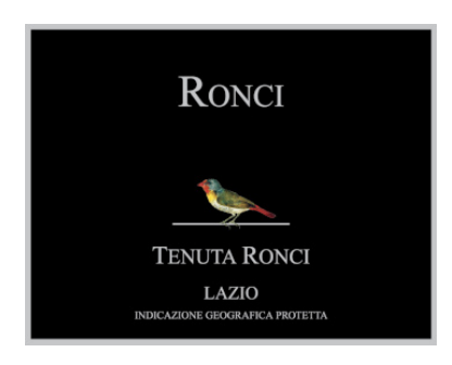
Ronci 2019 Tenuta Ronci di Nepi (Latium, Italy)