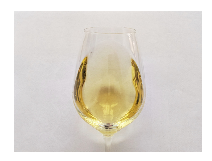
The color of Collio Ribolla Gialla

Before starting this month's tasting by contrast, as usual, let's buy the two bottles we will pour into our glasses. The wine to be more difficult to find is certainly Amelia Malvasia, also considering the volumes produced in its territory and the relative presence in the market. Undeniably easier to find