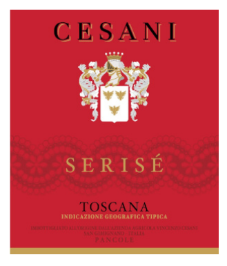
Serisè 2019 Cesani (Tuscany, Italy)

If Stuffed pasta with fish, Roasted fish, Roasted white meat, Mushroom soups, Legume soups