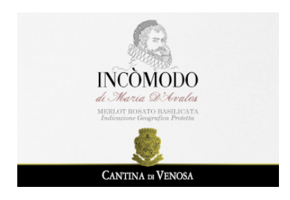
Incomodo 2021 Cantina di Venosa (Basilicata, Italy)

Roasted meat, Stewed meat with mushrooms, Broiled meat and barbecue, Cheese