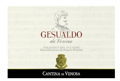
Aglianico del Vulture Gesualdo da Venosa 2019 Cantina di Venosa (Basilicata, Italy)

Pasta with meat, Broiled fish, Roasted white meat, Mushroom and legume soups, Cheese