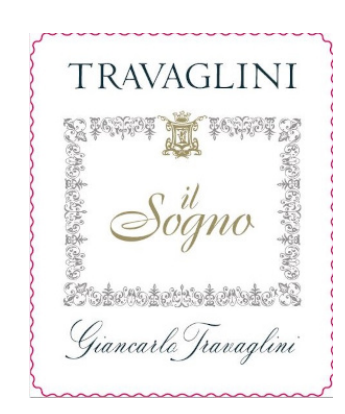
Il Sogno 2018 Travaglini (Piedmont, Italy)

Game, Roasted meat, Stewed and braised meat with mushrooms, Hard cheese