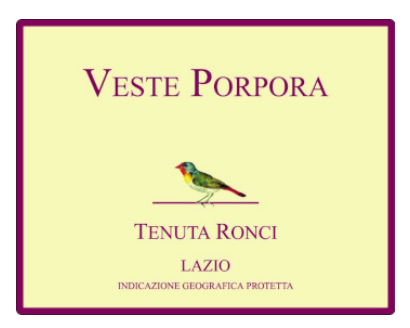
Veste Porpora 2020 Tenuta Ronci di Nepi (Latium, Italy)

Game, Stewed and braised meat, Roasted meat, Hard cheese