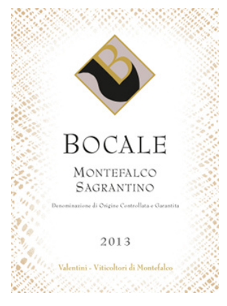
Montefalco Sagrantino 2013 Bocale (Umbria, Italy)

Stuffed pasta, Broiled crustaceans, Roasted white meat, Roasted fish, Mushroom soups