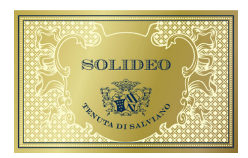
Lago di Corbara Rosso Solideo 2014 Tenuta di Salviano (Umbria, Italy)