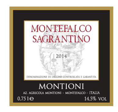
Montefalco Sagrantino 2014 Montioni (Umbria, Italy)

Stuffed pasta, Broiled meat and barbecue, Stewed meat with mushrooms. Cheese