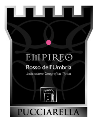
Empireo 2014 Pucciarella (Umbria, Italy)

Broiled meat and barbecue, Roasted meat, Stewed meat with mush-rooms. Cheese