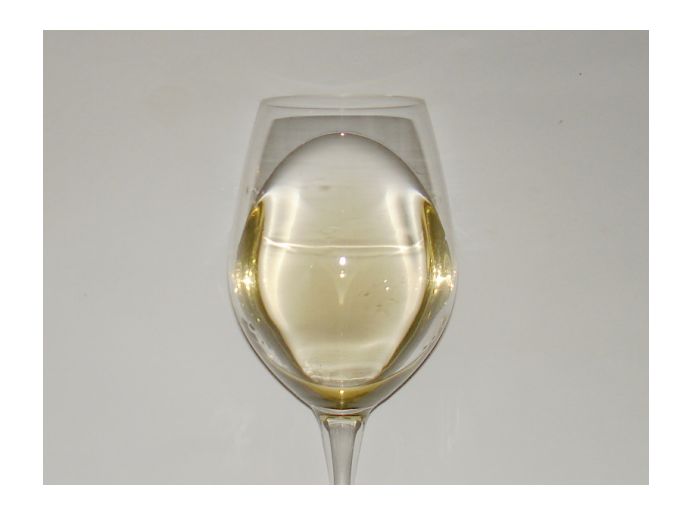
The color of Offida Passerina

Passerina and Torbato have different olfactory profiles, however both having in common aromas of good elegance although of moderate intensity. The profiles of wines produced with these varieties are in fact expressed in terms of finesse rather than