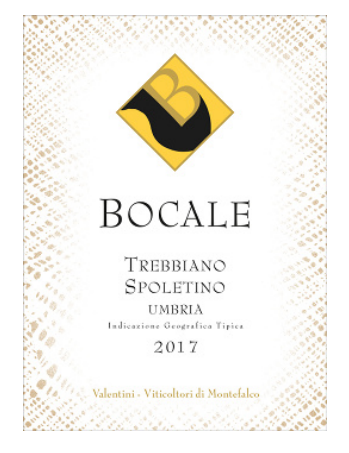
Trebbiano Spoletino 2017 Bocale (Umbria, Italy)