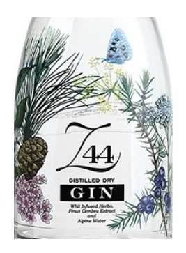
Z44 Distilled Dry Gin Roner (Alto Adige, Italy)

Review of Grappa, Distillates and Brandy