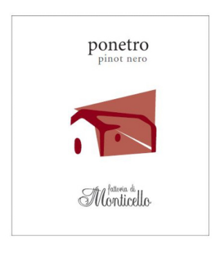
Ponetro 2016 Fattoria di Monticello (Umbria, Italy)

🚺 Game, Roasted meat, Stewed and braised meat, Hard cheese