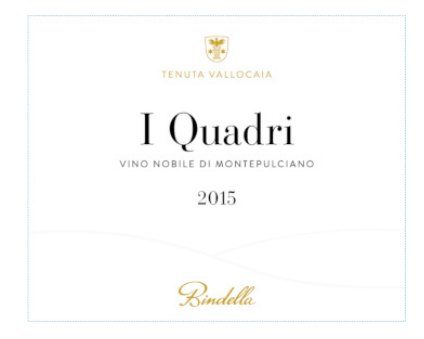
Vino Nobile di Montepulciano I Quadri 2015 Bindella (Tuscany, Italy)