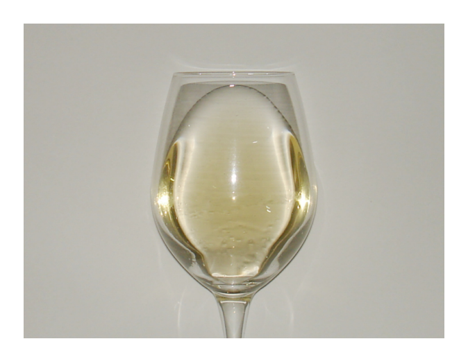
The color of Petite Arvine

Let's proceed with our tasting by contrast and by evaluating the olfactory profiles of the two wines and, as opposed to the appearance examination, the first wine we are going to evaluate is Castel del Monte Bombino Bianco. By keeping the glass in vertical position and, without swirling, let's proceed with the first smell in order to appreciate the opening of the Apulian wine. From the glass we perceive aromas of moderate intensity directly recalling apple, pear and a floral note of hawthorn.