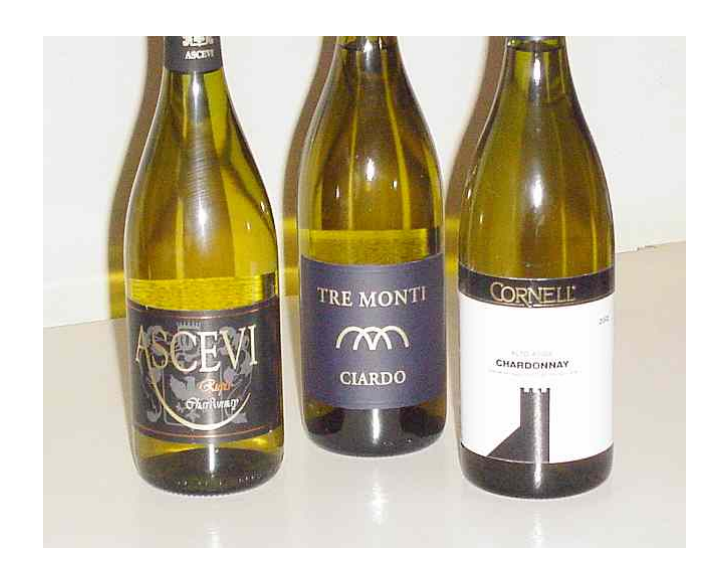
The Three Chardonnays of our Comparative Tasting

The first wine of our comparative tasting is Ascevi Luwa's Rupis Chardonnay, produced in Friuli Venezia Giulia, it is the