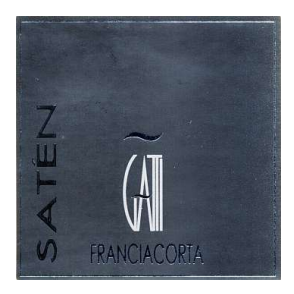
Franciacorta Satèn 2001 Enrico Gatti (Lombardy, Italy)

Food match: Roasted fish, Stuffed pasta, Broiled crustaceans