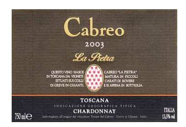
Cabreo La Pietra 2003 Tenute Folonari (Tuscany, Italy)

Food match: Game, Roasted meat, Braised and stewed meat, Hard cheese