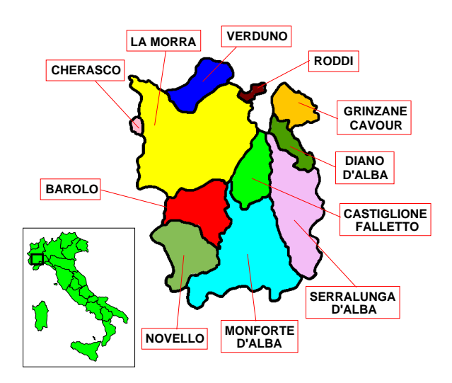
Fig. 1: The production communes of Barolo

Barolo has always been a very famous wine, also when it was practically unknown and very far from the image of a great wine to which we are used today. The first historical documents related to Barolo referred not to the wine but to the grape with which it is produced: Nebbiolo. The first document about this grape variety date back to 1268, in a document of Rivoli castle,