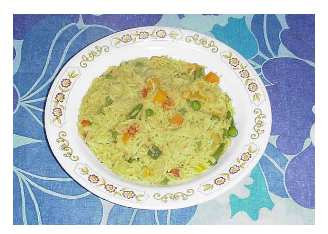
Rice with curry and vegetables: one of the many tasty dishes of vegetarian cooking

In all types of vegetarianism there is the common refusal of meat, and, besides this, other kinds of foods can be eliminated from diet as well, including the products of animal origin: eggs, milk and cheese. Therefore, we can distinguish - among the most permissive vegetarian diets - lacto-ovo vegetarianism , which provides for the abstinence from meat and the consumption of milk, dairy products and eggs; ovo vegetarianism , characterized by the consumption of eggs and the abstinence from meat, milk and dairy products; Lacto vegetarianism , characterized by the consumption of milk, dairy products and by the abstinence from meat and eggs. Restrictive vegetarian diets - also called veg-