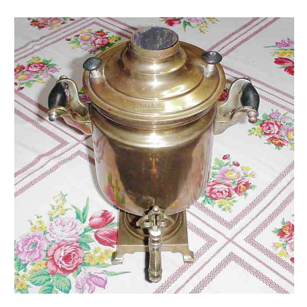
Samovar, protagonist of Russian tea culture

The work of Lu Yu is still today considered as an important reference for every tea enthusiast. His figure, his thoughts and his lifestyle - completely dedicated to the cult of tea and to the harmonious relationship of man with nature - have been so important as to consider Lu Yu as the god of tea. Soon after, everywhere in China were established the so called tea houses , public places where people gathered together, talking and drinking tea. Tea houses are still today very common in the country and represent an important reference for social life. In China the consumption of tea is almost completely about green tea, of which exists hundreds of different varieties, each having its aromas, flavors and properties. In China are also appreciated the so called Hua Cha - that is tea aromatized with flower petals, such as jasmine and chrysanthemums - as well as semi-fermented teas. China is the country having the most ancient tea culture - the plant of tea, the Camellia Sinensis is in fact from China - and the way of preparing the infusion has changed in the course of the centuries. Today, just like in most of the countries in the world, tea in China