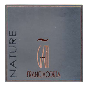
Franciacorta Nature Enrico Gatti (Lombardy, Italy)

Prices are to be considered as indicative. Prices may vary according to the country or the shop where wines are bought