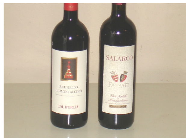
The Brunello di Montalcino and Vino Nobile di Montepulciano of our comparative tasting

Brunello di Montalcino - despite of its success and notoriety in Italy and in the world - is a wine having a relatively recent history. The presence of Brunello grape in Montalcino is documented in some writings dated back to 1500s, in which are praised the good quality of the grape and of its wine, but it will be only at the end of 1800s Brunello di Montalcino - the wine -