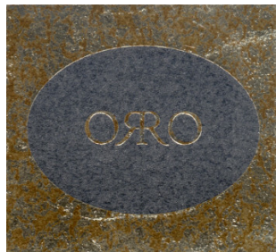
Grappa Oro Bindella (Tuscany, Italy) (Distiller: Distillerie Berta)

Distillates are rated according to DiWineTaste's evaluation method. Please see score legend in the "Wines of the Month" section.