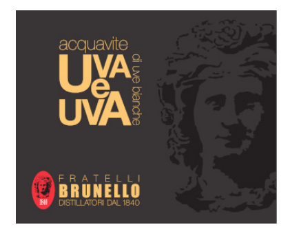
Uva e Uva Fratelli Brunello (Veneto)

Review of Grappa, Distillates and Brandy