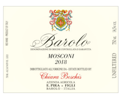
Barolo Mosconi 2018 E. Pira & Figli - Chiara Boschis (Piedmont, Italy)

(1) Roasted meat, Stewed and braised meat with mushrooms, Hard cheese