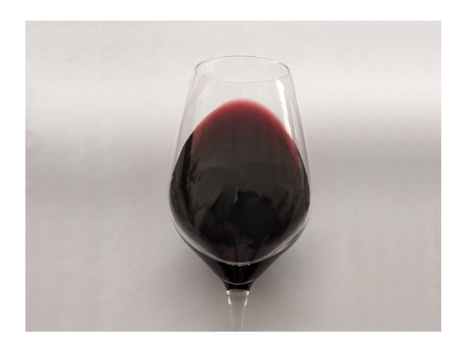
The Color of Lacrima di Morro d'Alba

Let's start preparing this month's tasting by contrast, by first purchasing the two wines we will pour into the glasses. Finding the bottles shouldn't be any difficulty, as these are two wines which enjoy a good production and diffusion. We will however try to compare wines produced in inert containers, such as steel and cement tanks, which is very frequent for Lacrima di Morro d'Alba, a little less for Chianti Colli Senesi. This enological characteristic will allow the grapes making up the two wines to express their sensorial characteristics without excessive alterations. In both cases we will also have to pay attention to the composition, as the respective disciplinary allows the use of many varieties. In the case of Lacrima di Morro d'Alba, we will make sure the wine is produced with the homonymous variety alone, while for Chianti Colli Senesi we will choose a bottle produced with at least 80% Sangiovese and the remaining part Canaiolo Nero. The two wines belong to the latest vintage and are poured into their respective tasting glasses at a temperature of 17 °C. (63 °F)