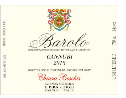
Barolo Cannubi 2018 E. Pira & Figli - Chiara Boschis (Piedmont, Italy)

Game, Roasted meat, Stewed and braised meat with mushrooms, Hard cheese