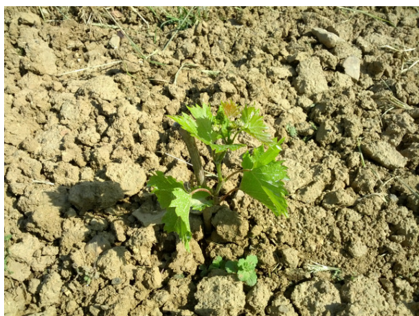
A young vine: a strong bond with the soil which will be expressed by its wines

To these factors given by Nature to every single territory, are added the unavoidable intervention of man and how he interacts with local factors, by limiting, as much as possible, every condition of corruption. Every agricultural and viticultural intervention done by man on the environment, in this sense also including every wine making practice, ideally move the wine away from the authentic and genuine expression of terroir . This does not mean, in any case, man should completely delegate the expressive role to Nature, because - it should be noted - wine does not exist in Nature and its production unavoidably requires the work of man. The intervention and talent of man in fact plays the fundamental role of control and verification of every viticultural and wine making process, in order to ensure a genuine and sound product, with no faults which could compromise the objective quality of wine.