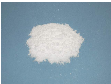
Crystals of potassium metabisulfite: the most common way to add sulfur dioxide to wine and must

The reasons why sulfur dioxide is used in enology are many.