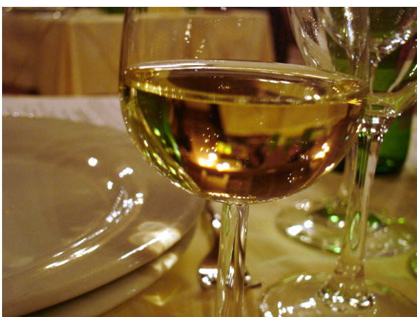
Glasses at the table of a restaurant: this place is not always suited for wine sensorial tasting