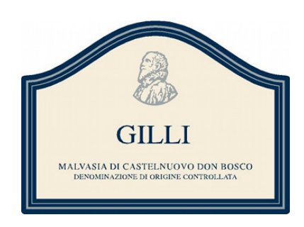
Malvasia di Castelnuovo Don Bosco 2011 Cascina Gilli (Piedmont, Italy)

Food match: Cold cuts, Sauteed meat with mushrooms, Stewed meat