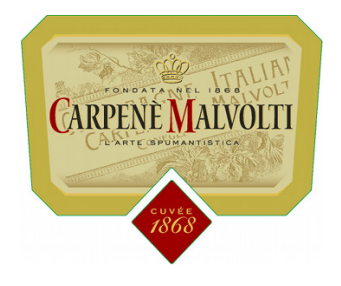
Cuvée 1868 Brut Carpenè Malvolti (Veneto, Italy)

Food match: Game, Roasted meat, Stewed and braised meat, Hard cheese