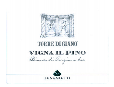
Torgiano Bianco Torre di Giano Vigna II Pino 2009 Lungarotti (Umbria, Italy)

Food match: Pasta and risotto with crustaceans and vegetables, Sauteed crustaceans, Vegetable soups