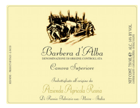
Barbera d'Alba Superiore Canova 2010 Ressia (Piedmont, Italy)

Food match: Broiled crustaceans, Mushroom soups, Stuffed pasta