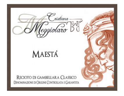
Recioto di Gambellara Classico Maestà 2008 Cristiana Meggiolaro (Veneto, Italy)

Food match: Pasta and risotto with fish, Sauteed white meat, Fish and mushroom soups