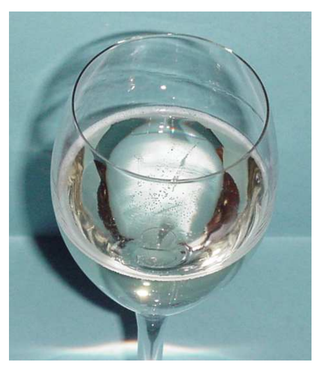
The bubbles in sparkling wines develop thanks to the presence of carbon dioxide

The two methods are today known as short Charmat method - or simply Charmat method , in case the production has a duration from three to six months; long Charmat method or Cavazzani method , in case the duration is from six to twelve months. It should be noticed the method invented by Nereo Cavazzani provides for some agitators inside the tank, which, periodically, put the fermentation sediments in suspension, therefore giving the wine a fuller body and a better sensorial complexity. The goal of all methods is to obtain a wine in