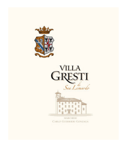
Villa Gresti 2006 Tenuta San Leonardo (Trentino, Italy)

Food match: Dried fruit tarts, Confectionery