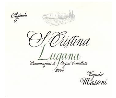
Lugana Santa Cristina Vigneto Massoni 2004 Zenato (Italy)

Food match: Roasted meat, Broiled meat and barbecue, Stewed meat, Hard cheese