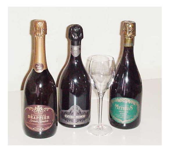
Everything is ready for our comparative tasting

Despite the production techniques and the grapes used are more or less the same as in Champagne, it is appropriate to remember every area gives its wines its personal character impossible to find elsewhere. Despite this fundamental and important consideration, many wine lovers keep on arguing on which sparkling wine is better, without considering each one of them is unique in its genre. No matter the region of origin, the grapes mainly used for the production of classic method sparkling wines are Chardonnay and Pinot Noir, to which are sometimes added grapes belonging to local traditions as well as other grapes capable of giving the wine its typical character . The same can be said for the production system that, despite it is defined in many ways in the respective disciplinary and according to appropriate