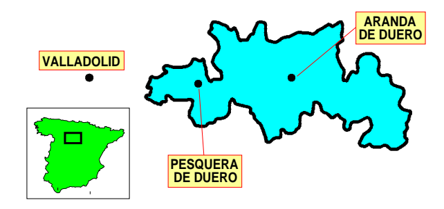
Fig. 1: Ribera del Duero

Despite Ribera del Duero has been recognized as a quality production area since a little more than twenty years, its history - according to an enological point of view - began almost 150 years