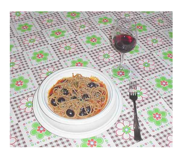
A red wine can be a good match for pasta

wheat flour ( Triticum Vulgaris ), usually kneaded with eggs or water, and with durum wheat flour ( Triticum Durum ), generally kneaded with water.