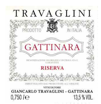
Gattinara Riserva 1999 Travaglini (Italy)

Food match: Game, Roasted meat, Braised and stewed meat, Hard cheese