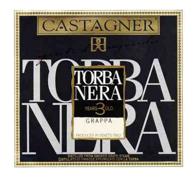
Torba Nera Castagner (Italy)

This grappa shows a brilliant amber yellow color, limpid and crystalline. The nose denotes intense, clean, pleasing and refined aromas of vanilla, licorice, prune, leather, honey, cocoa, violet, hazelnut and raspberry, with almost imperceptible alcohol pungency. The mouth is intense with perceptible alcohol pungency which tends to dissolve rapidly, pleasing smoothness, good and balanced sweet hint, agreeable. The finish is persistent with flavors of hazelnut, licorice and prune. A well made grappa distilled in bainmarie discontinuous alembic still. It ages for 4 years in oak and acacia casks. Alcohol 50%.