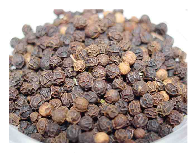
Black Pepper Grains

Among the many legends of the Middle Age, there was one about pepper: it was believed its brown color was because the method with which was harvested. According to this legend, cultivators were forced to use fire in order to expel serpents which infested pepper cultivations, therefore burning the berries which in turn got their characteristic shape and color. Pepper has been a spice reserved to the tables of rich people, both appreciated for the exotic taste it was capable to give to daily foods, as well as for the image of exclusivity and rarity, a real status symbol of those times. In England, in 1180, in order to better control the trade of pepper in the whole nation, was founded in London the