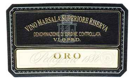
Marsala Superiore Riserva Oro Carlo Pellegrino (Italy)

Food match: Chocolate tarts, Fruit jam tarts