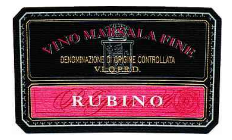
Marsala Fine Rubino Carlo Pellegrino (Italy)

Prices are to be considered as indicative. Prices may vary according to the country or the shop where wines are bought