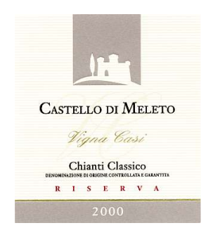
Chianti Classico Riserva Vigna Casi 2000 Castello di Meleto (Italy)

Food match: Game, Roasted meat, Braised and stewed meat, Hard cheese