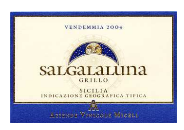
Salgalaluna 2004 Miceli (Italy)

Food match: Game, Roasted meat, Stewed and braised meat, Hard cheese