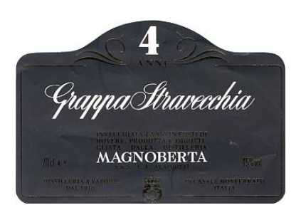
Grappa Stravecchia 4 Anni Distilleria Magnoberta (Italy)

Raw matter: Pomace of Barbera, Grignolino and Freisa