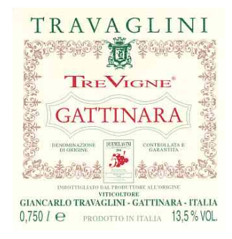
Gattinara Tre Vigne 1999 Travaglini (Italy)

Food match: Roasted fish, Fish and mushrooms soups, Braised fish, Roasted white meat