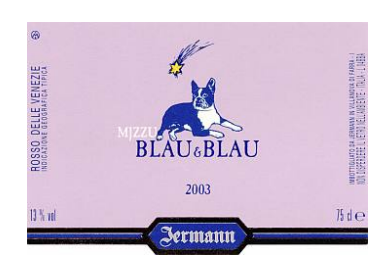
Mjzzu Blau & Blau 2003 Jermann (Italy)

Food match: Pasta and risotto with fish and crustaceans, Sauteed fish and crustaceans