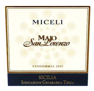
Majo San Lorenzo 2001 Miceli (Italy)

Food match: Fried fish, Pasta and risotto with fish and crustaceans