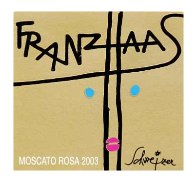
Alto Adige Moscato Rosa 2003 Franz Haas (Italy)

Food match: Vegetables soups, Pasta and risotto with vegetables and fish, Sauteed fish and white meat