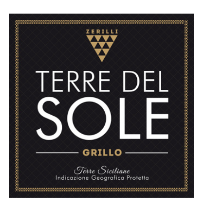
Grillo 2016 Terre del Sole (Sicily, Italy)