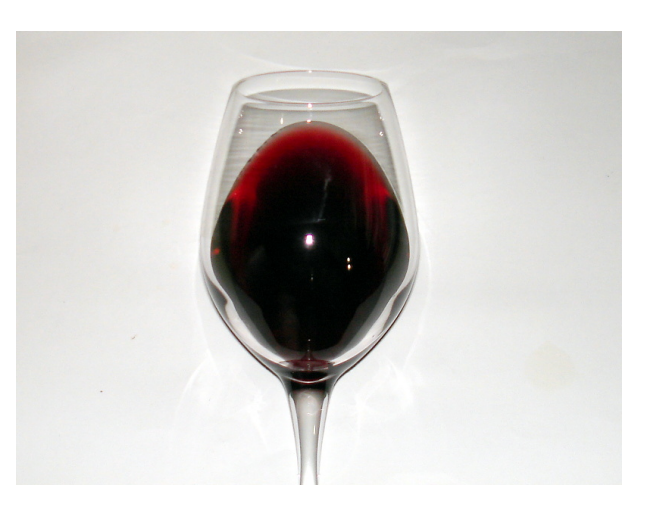
The color of Mendoza Malbec

The olfactory profiles of Bonarda Piemontese and Malbec