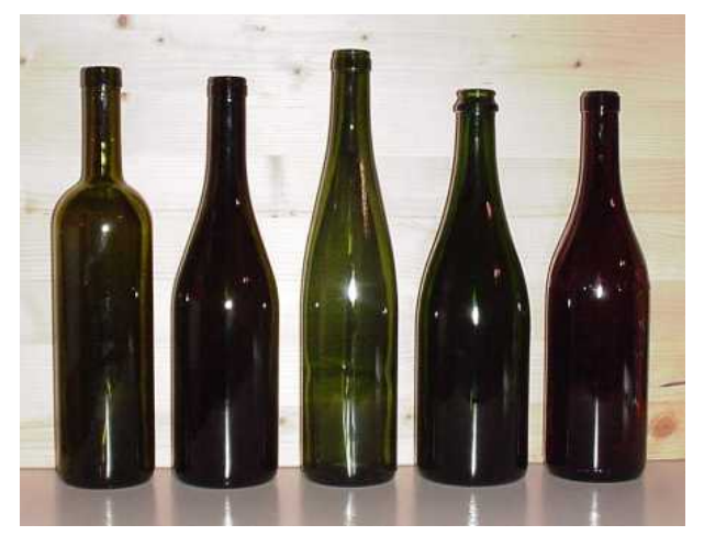
Wine bottles. From left to right: Bordelais, Burgundy, Flute, Champagne, Albeisa

If it is true nothing can be done on the wine after the bottle has been sealed, it is also true we can arrange things in order to make sure the wine will be bottled in its best possible conditions. For this reason it is absolutely important to test the stability and health of wine before proceeding with bottling. Likewise, it will be indispensable to ensure the best conditions both for bottles and corks. It is superfluous to remind a non perfectly clean bottle can represent a menace for the keeping and the evolution of wine, as the presence of any bacteria can easily spoil the wine. Also the storage and keeping of bottles requires proper precautions and conditions, also reminding in case natural corks are being used because of a bad keeping, as well as of a bad quality of the cork itself - they could lose their elasticity or they could give the wine bad smells or faults.