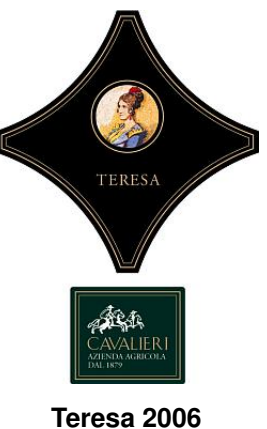
Cavalieri (Latium, Italy)

Food match: Stuffed pasta, Roasted fish, Fish and mushroom soups, Roasted white meat