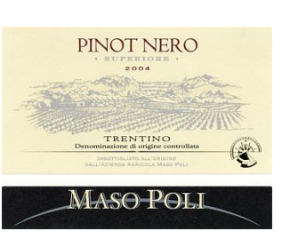
Trentino Superiore Pinot Nero 2004 Maso Poli (Trentino, Italy)

Food match: Stuffed pasta, Roasted fish, Roasted white meat