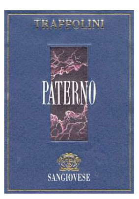
Paterno 2005 Trappolini (Latium, Italy)