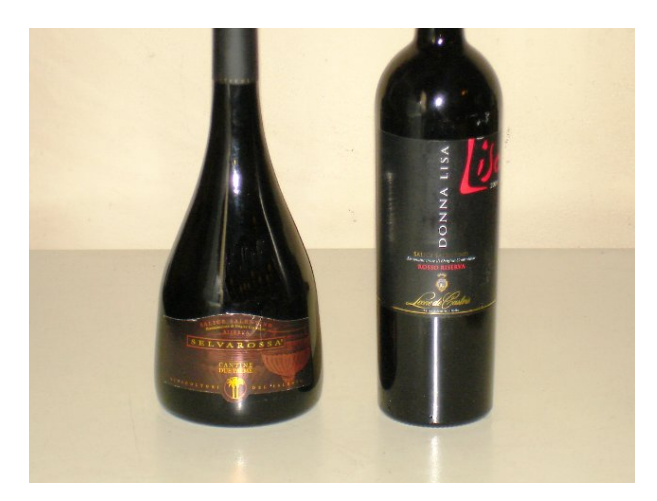
Two of the wines of our comparative tasting: Cantine Due Palme's Salice Salentino Rosso Riserva Selvarossa and Leone de Castris' Salice Salentino Rosso Riserva Donna Lisa

Nera, aged in cask for 10 months. The second wine of our comparative tasting is Cantina Due Palme's Salice Salentino Rosso Riserva Selvarossa, in which Negroamaro is present for 90%, aged for 12 months in barrique. The third wine is Leone de Castris' Salice Salentino Rosso Riserva Donna Lisa, also in this case from Negroamaro and Malvasia Nera grapes, in which has been used a longer aging, about 20 months in barrique. All the wines are selected according to the vintages currently commercialized and will be evaluated at the temperature of 18°C (65°F) in ISO tasting glasses.