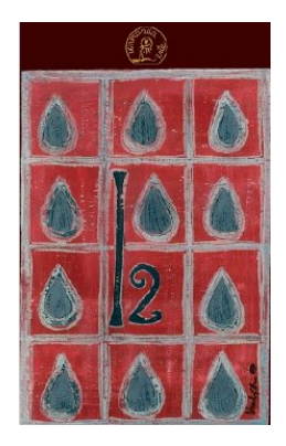
I2 2007 Veneranda Vite (Marches, Italy)

Food match: Roasted meat, Broiled meat and barbecue, Hard cheese