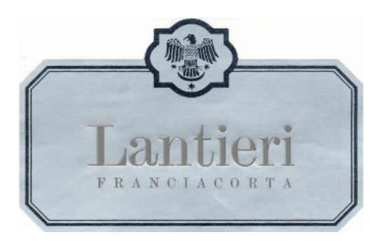
Franciacorta Satèn Lantieri de Paratico (Lombardy, Italy)

Food match: Game, Roasted meat, Braised meat, Hard cheese