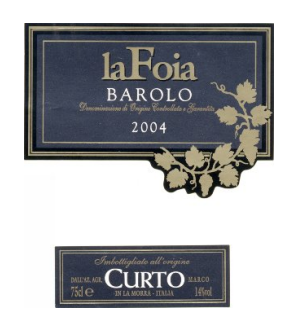
Barolo La Foia 2004 Curto Marco (Piedmont, Italy)

Food match: Stuffed pasta, Broiled meat and barbecue, Stewed meat with mushrooms