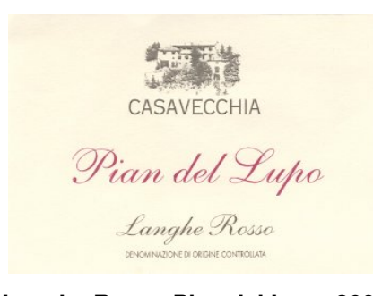
Langhe Rosso Pian del Lupo 2004 Casavecchia Marco (Piedmont, Italy)

Food match: Roasted meat, Stewed and braised meat, Hard cheese