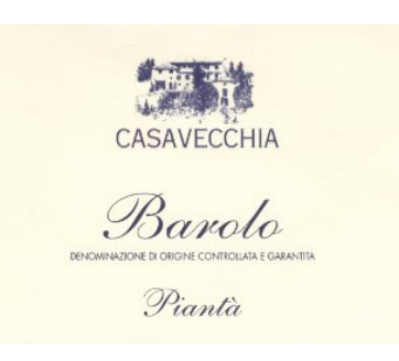
Barolo Piantà 2004 Casavecchia Marco (Piedmont, Italy)

Food match: Roasted meat, Stewed and braised meat with mushrooms, Hard cheese