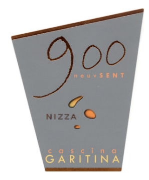
Barbera d'Asti Superiore Nizza Neuvsent 2007 Cascina Garitina (Piedmont, Italy)

Food match: Hard and piquant cheese, Confectionery