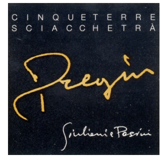
Cinque Terre Sciacchetrà Pregin 2007 Giuliani e Pasini (Liguria, Italy)

Food match: Fried fish, Sauteed fish, Pasta with fish, Sauteed white