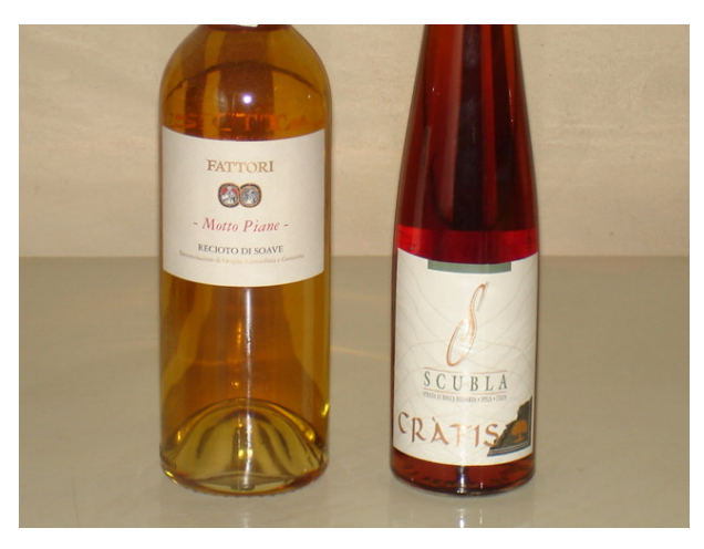
The Recioto di Soave and Verduzzo Friulano of our comparative tasting