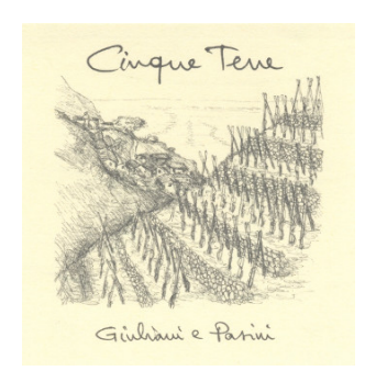
Cinque Terre 2009 Giuliani e Pasini (Liguria, Italy)

Food match: Roasted meat, Broiled meat and barbecue, Stewed and braised meat, Hard cheese