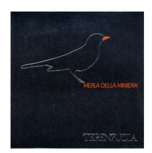
Merla della Miniera 2006 Terenzuola (Tuscany, Italy)

Food match: Roasted white meat, Roasted fish, Stuffed pasta, Mushroom soups