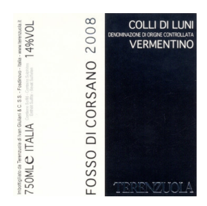
Colli di Luni Vermentino Fosso di Corsano 2008 Terenzuola (Tuscany, Italy)