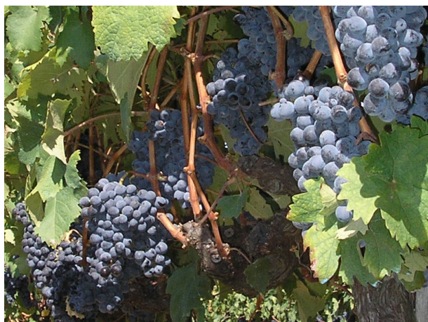
Clusters of Sangiovese: among the most common grapes in Italy, its wines offer remarkable possibilities for the study and understanding of varietal and territorial diversity

Let's begin this type of study and, to do so, we will compare three wines produced with these grapes, belonging to the same vintage and vinified as dry. This is a fundamental aspect, as Muscat Blanc and Brachetto are frequently vinified as sparkling, in particular in Italy. It is not required the three wines to be from the same territory or country: in this case we are interested in studying the aromatic characteristic of these grapes and their wines. This does not mean all the wines produced with these grapes have the same organoleptic qualities. With time we will understand also these grapes - having a strong and intense character - can have remarkable differences in function of the territory and vintage. In the beginning it will be enough to understand the peculiar characteristics of each of them by comparing the three wines one to each other in order to understand their analogies