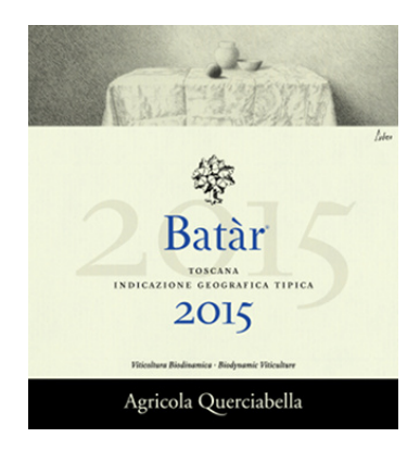
Batàr 2015 Querciabella (Tuscany, Italy)

Prices are to be considered as indicative. Prices may vary according to the country or the shop where wines are bought