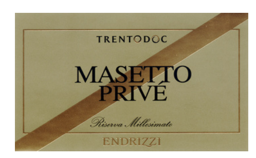
Trento Dosaggio Zero Riserva Masetto Privé 2008 Endrizzi (Trentino, Italy)