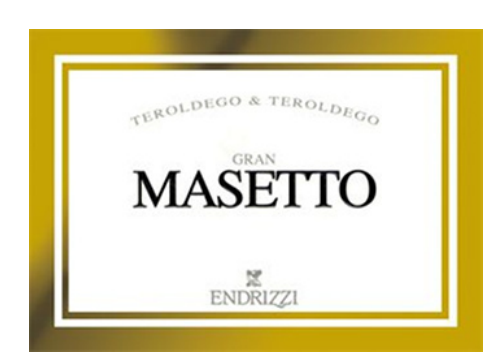
Gran Masetto 2013 Endrizzi (Trentino, Italy)

Stuffed pasta, Mushroom soups, Roasted white meat, Stewed meat, Roasted fish