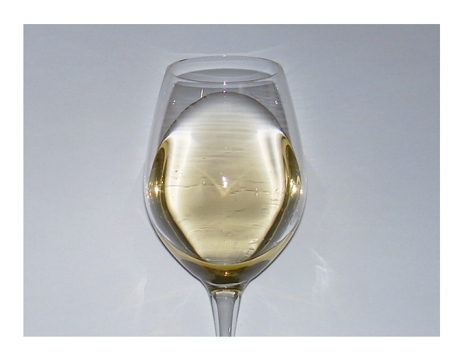
The color of Incrocio Manzoni Bianco 6.0.13

The choice of wines for this month's tasting by contrast will not be particularly difficult as, in both cases, the offer of Coda di Volpe and Incrocio Manzoni 6.0.13 wines is quite rich in the areas where they are made. As for Coda di Volpe, our choice will be in favor of a bottle produced in the Denominazione d'Origine Controllata Sannio, in the province of Benevento. As for the wine produced with Incrocio Manzoni 6.0.13, we will pick a bottle made in one of the areas of Veneto where this variety is particularly common, Piave DOC, belonging to the provinces of Treviso and Venice. In both cases we need to make sure the wines are produced exclusively with the respective varieties alone, because – as this frequently happens in Italy – the disciplinary pro-