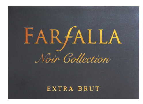
Farfalla Noir Collection Extra Brut Ballabio (Lombardy, Italy)

🚹 Game, Roasted meat, Stewed and braised meat, Hard cheese