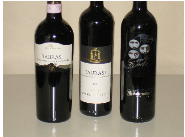
The three Taurasi wines of our comparative tasting

Aglianico is one of the most interesting grapes of the Italian wine scene and one of its most famous sons certainly is Taurasi. Defined as the Barolo of the South , Taurasi is produced with 100% Aglianico, a wine rich and complex, with a pretty robust structure. The famous red wine of Campania - the first one of the region to be granted DOCG status ( Denominazione d'Origine Controllata e Garantita , Denomination of Controlled and Guaranteed Origin) - takes its name from the homonymous town in the province of Avellino. The viticultural fame of Taurasi was mentioned by Titus Livius, who described the area as rich in vines from which was produced a precious wine for the Roman Empire. Taurasi wine was also mentioned in later centuries: Andrea Bacci - in his "Natural