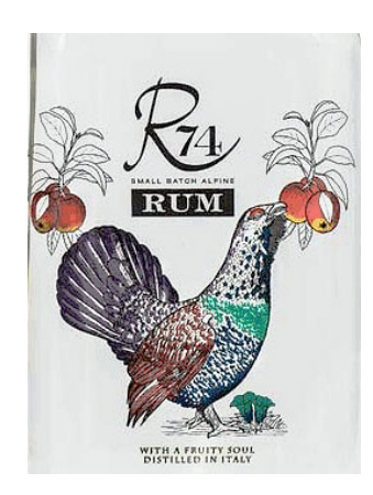
Rum Alpino R74 White Roner (Alto Adige)

Review of Grappa, Distillates and Brandy