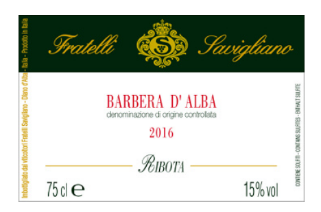
Barbera d'Alba Ribota 2016 Fratelli Savigliano (Piedmont, Italy)

Game, Roasted meat, Stewed and braised meat, Hard cheese