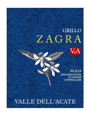
Zagra 2017 Valle dell'Acate (Sicily, Italy)