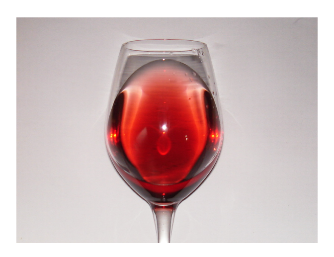
The color of Lambrusco di Sorbara

Lambrusco di Sorbara and Vernaccia Nera make wines with very different olfactory profiles, in both cases with clear and intense hints of fruit sensations. Lambrusco di Sorbara is more oriented towards aromas reminiscent of fruit with a red skin