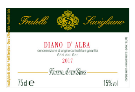
Diano d'Alba Sori del Sot Vigneto Autin Gross 2017 Fratelli Savigliano (Piedmont, Italy)

Stuffed pasta, Broiled meat and barbecue, Stewed meat with mushrooms, Roasted meat