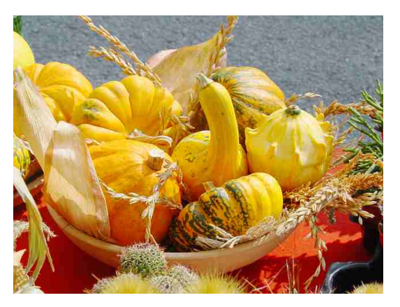
In its many shapes and colors, pumpkin is a versatile and useful vegetable, not only in kitchen

The most known varieties of pumpkins are Cucurbita maxima (sweet pumpkin) and Cucurbita moschata . Cucurbita maxima has a fruit - that is the part commonly known with the name of pumpkin - of pretty big size, it can also weigh 80 kilograms (176 pounds). To this species belongs the big wintertime pumpkins, with a turban shaped aspect, as well as the big oval shaped pumpkins, with a yellow-orange pulp, pretty floury and with a basically sweet taste. The skin of ripe pumpkin shows a greengray or yellow color as well as orange-red. Pumpkins belong-