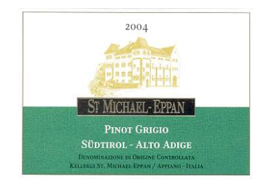
Alto Adige Pinot Grigio 2004 San Michele Appiano (Alto Adige, Italy)

Food match: Roasted fish, Roasted white meat, Stewed fish, Stuffed pasta with mushrooms