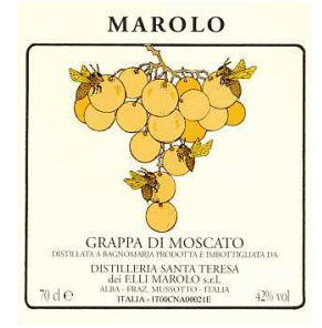
Grappa di Moscato 2004 Santa Teresa Marolo (Piedmont, Italy)

This grappa shows an intense amber yellow color, limpid and crystalline. The nose reveals intense, clean, pleasing, refined and elegant aromas of prune, cherries macerated in alcohol, vanilla, licorice, honey, cocoa, tobacco, dried violet, mace and almond, with almost imperceptible alcohol pungency. In the mouth has intense flavors, good roundness, perceptible alcohol pungency which tends to dissolve rapidly, excellent correspondence to the nose, very agreeable. The finish is very persistent with long flavors of prune, licorice, honey and cocoa. A well made grappa distilled in bainmarie discontinuous alembic still. It ages for 12 years in small oak and acacia barrels. Alcohol 50%.