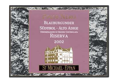
Alto Adige Pinot Nero Riserva 2002 San Michele Appiano (Alto Adige, Italy)

Food match: Fish appetizers, Pasta and risotto with crustaceans, Eggs