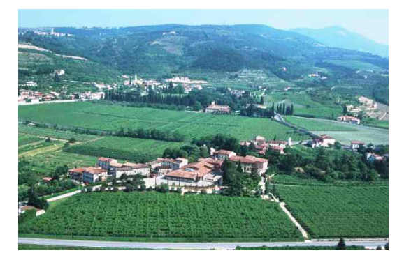
Masi winery at Gargagnago (Verona)

In the course of the years, the winery has developed thanks to the acquisition of new vineyards located in the classic areas of Valpolicella, Bardolino and Soave, uniquely selecting lands located in the best positions or vineyards having a historical importance. In the last ten years the property of Masi winery also spread in other areas of the Triveneto , in Friuli Venezia Giulia,