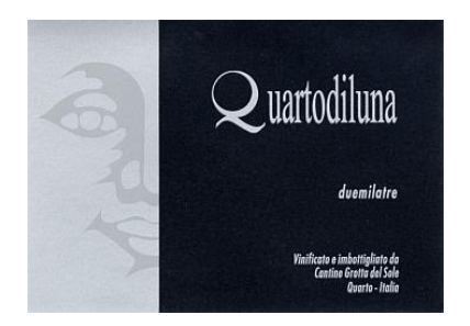
Quartodiluna 2003 Cantine Grotta del Sole (Campania, Italy)

Food match: Game, Roasted meat, Braised and stewed meat, Hard cheese