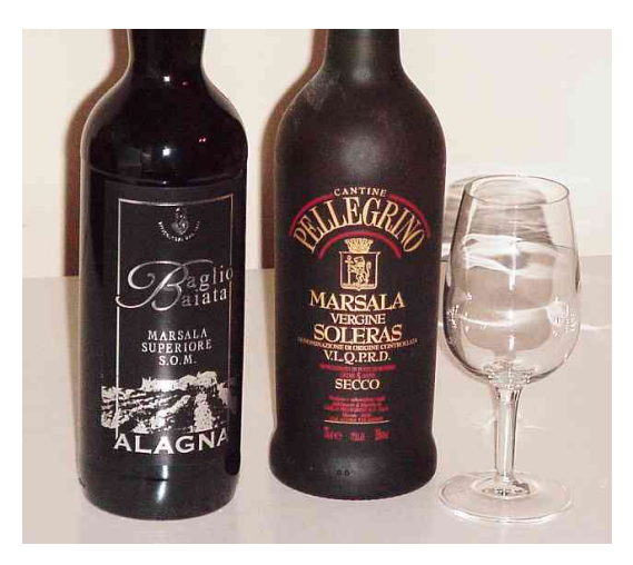
Rich in complex aromas and charming: Marsala is an excellent sensorial exercise for the taster