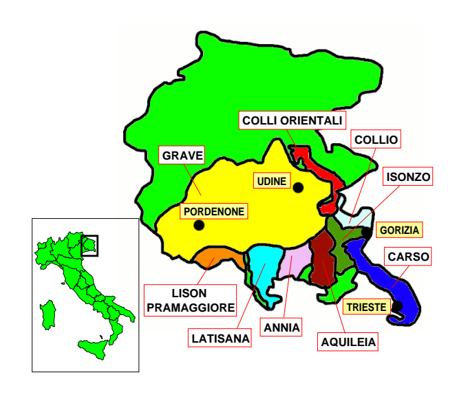
Fig. 1: Friuli Venezia Giulia