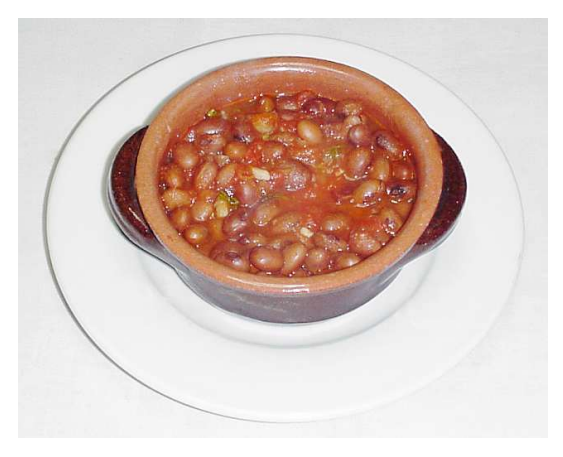
Famous representatives of the large family of legumes, beans are the protagonists of countless recipes

Even peas are legumes from the Mediterranean area and they were already known in ancient times: archaeological researches have in fact discovered their presence in Egyptian pyramids and in the ruins of ancient Troy. Of round aspect and green colored, peas - as opposed to most of legumes - are usually consumed fresh, with a basically sweet taste, they are used for the preparation of side dishes, soups, sauces for the condiment of pasta and rice, puddings and purees. There are many varieties of peas and all of them are classified into two categories: peas to be shelled and peas to be consumed as a whole, that is peas of which can be consumed the pod as well, such as taccole , typical in Lombardy. Whereas peas to be shelled are being commercialized both dried and fresh - usually boiled and canned - the other type of peas are commercialized fresh only. Among the most ancient legumes are also included lentils, with their typical flat shape, they have always been a fundamental food for ancient people and they are