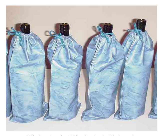
Blind tasting, by hiding bottles inside bags, is fundamental for the reliability of the result

The biggest pitfall in tasting a wine in the winery is when it is directly drawn off from the tank or cask, in particular when you personally take part to this operation. This kind of tasting - not very reliable because it is a young wine, not ready yet - is strongly influenced by the involvement on the situation, we believe to take part to something unique (and it really is) to taste something special few have the chance to taste. In other words, we are pleased by the privilege of directly tasting in the winery - and, once again, it is a real privilege - therefore obfuscating our critical and analytical sense. Tasting wine in a winery always