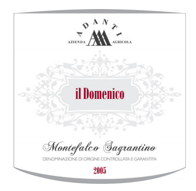
Sagrantino di Montefalco II Domenico 2005 Adanti (Umbria, Italy)

Food match: Game, Roasted meat, Stewed and braised meat, Hard cheese