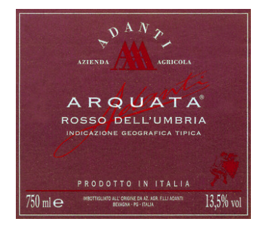
Arquata Rosso 2005 Adanti (Umbria, Italy)

Food match: Game, Roasted meat, Braised and stewed meat, Hard cheese