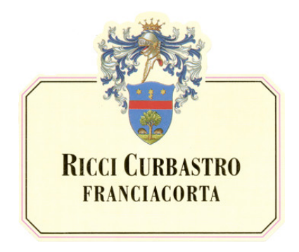
Franciacorta Demi Sec Ricci Curbastro (Lombardy, Italy)

Food match: Game, Roasted meat, Stewed and braised meat, Hard cheese