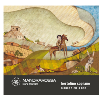
Sicilia Bianco Mandrarossa Bertolino Soprano 2018 Cantine Settesoli (Sicily, Italy)

Game, Roasted meat, Stewed and braised meat, Hard cheese