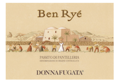
Passito di Pantelleria Ben Ryé 2019 Donnafugata (Sicily, Italy)

Game, Braised meat, Roasted meat, Cheese