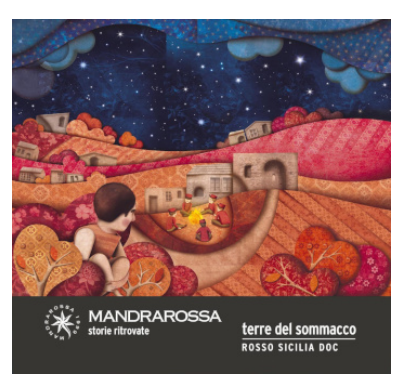
Sicilia Rosso Mandrarossa Terre del Sommacco 2017 Cantine Settesoli (Sicily, Italy)

Stuffed pasta with fish, Roasted fish, Legume soups, Roasted white meat