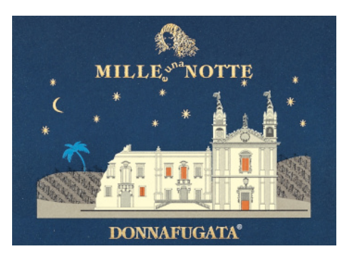
Sicilia Rosso Mille e Una Notte 2018 Donnafugata (Sicily, Italy)

Pasta with fish and vegetables, Sauteed fish, Sauteed white meat, Vegetable flans, Dairy products