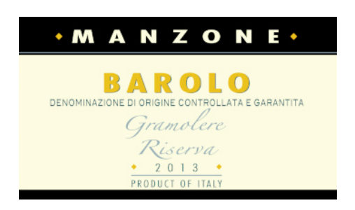
Barolo Riserva Gramolere 2013 Manzone Giovanni (Piedmont, Italy)