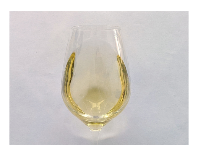
The color of Etna Bianco

The wines we will pour into the glasses of our tasting by contrast are characterized – as usual – by enological and productive analogies, that is, by factors which can ensure the least possible interference due, for example, to the use of wooden containers. This premise is essential as both Etna Bianco and Offida Pecorino can be produced with the fermentation and aging in cask. We will therefore make sure the two bottles we are going to evaluate contain wines produced exclusively by fermentation and aging in inert containers, preferably the steel tank. Furthermore, we will pay attention to the composition of the two wines, as the respective production disciplinary allow the use of many varieties. For this reason, we will make sure Etna Bianco is exclusively produced with Carricante and