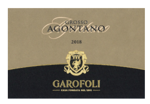
Conero Riserva Grosso Agontano 2018 Garofoli (Marches, Italy)

Stuffed pasta with mushrooms, Roasted fish, Roasted white meat, Stewed fish