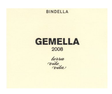
Gemella 2008 Bindella (Tuscany, Italy)