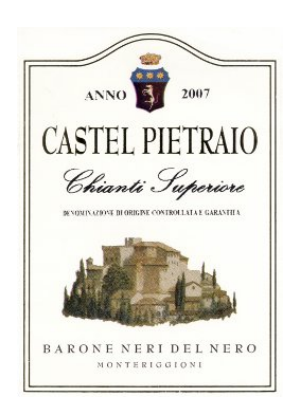
Chianti Superiore 2007 Fattoria di Castel Pietraio (Tuscany, Italy)

Grapes: Sangiovese (90%), Canaiolo Nero (5%), Merlot (5%)