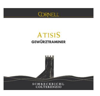
Alto Adige Gewürztraminer Atisis Cornell 2007 Produttori Colterenzio (Alto Adige, Italy)

Food match: Vegetable soups, Broiled crustaceans, Sauteed crustaceans, Risotto with crustaceans