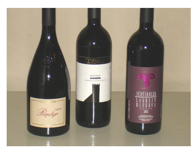
The three Alto Adige Lagrein wines of our comparative tasting

Lagrein Scuro - in case the grape is vinified as red - and Lagrein Kretzer or Lagrein Rosato (Rose), in case the grape is vinified as rose. It should be noticed Lagrein can also be used for the production of other DOC wines of Alto Adige, usually blended to typical varieties of the territory.