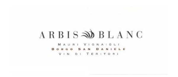
Arbis Blanc 2006 Borgo San Daniele (Friuli Venezia Giulia, Italy)

Food match: Game, Roasted meat, Stewed and braised meat, Hard cheese