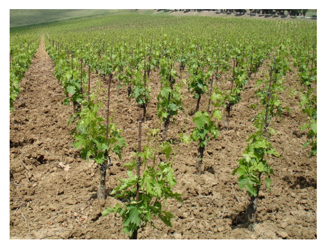
A young vineyard: here begins the journey of wine quality

For the sake of completeness, it should be said the variety