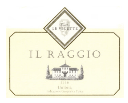
ll Raggio 2010 Le Velette (Umbria, Italy)

Food match: Roasted meat, Stewed meat, Braised meat, Hard cheese