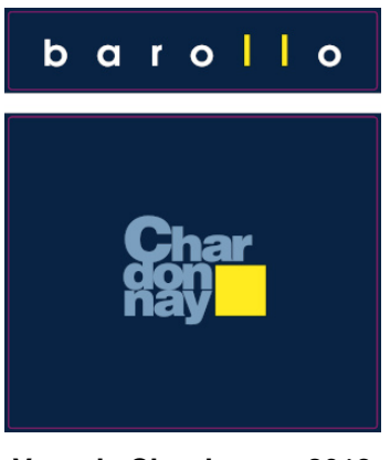
Venezia Chardonnay 2018 Barollo (Veneto, Italy)

🚯 Broiled meat and barbecue, Roasted meat, Stewed meat with mushrooms, Cheese