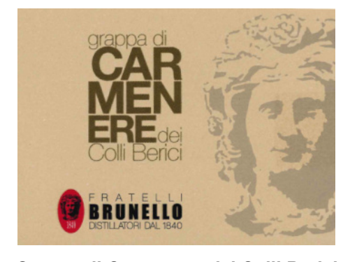
Grappa di Carmenere dei Colli Berici Fratelli Brunello (Veneto, Italy)

Review of Grappa, Distillates and Brandy