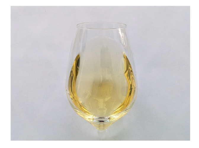
The color of Sannio Falanghina

The olfactory profiles of Gavi and Sannio Falanghina express decidedly different aromas on the nose, although in both we perceive common characteristics represented by flowers and fruits with white and yellow pulp. The protagonist of Gavi – wine recognized as Denomination of Controlled and Guaranteed Origin from the province of Alessandria, in Piedmont – is Cortese, a variety we also find in other wines of the region and it is present, although marginally, in other Italian regions as well. On the nose, Gavi expresses aromas of flowers and fruits, in which are mainly recognized aromas of hawthorn and broom, as well as aromas of pear, apple, peach and citrus. In this wine is also sometimes possible to perceive the scent of almond. In Sannio Falanghina we can smell floral aromas of broom and hawthorn, often of chamomile. As for fruit aromas, in wines made with this grape from Campania can be mainly