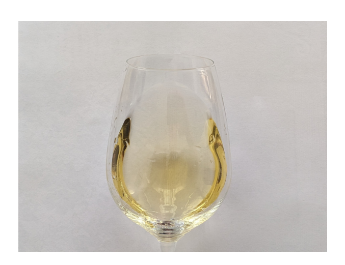
The color of Alto Adige Müller Thurgau

We can now start our tasting by contrast and pour Alto Adige Müller Thurgau and Cirò Bianco into their respective tasting glasses. The first wine we will examine is the one from Alto