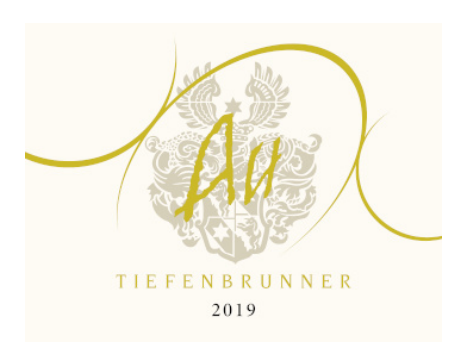
Alto Adige Chardonnay Riserva Vigna Au 2019 Tiefenbrunner (Alto Adige, Italy)

Pasta with fish and crustaceans, Broiled crustaceans, Sauteed fish, Sauteed white meat, Vegetable flans, Dairy products