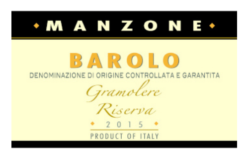
Barolo Riserva Gramolere 2015 Manzone Giovanni (Piedmont, Italy)