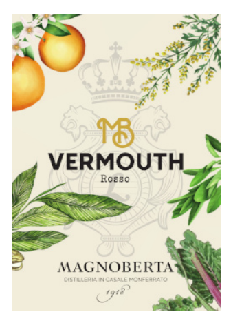
Vermouth Rosso MB Magnoberta (Piedmont, Italy)

Prices are to be considered as indicative. Prices may vary according to the country or the shop where wines are bought