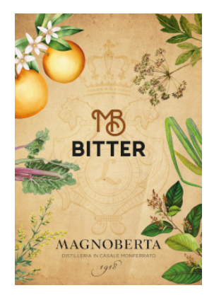
Bitter MB Magnoberta (Piedmont)

Review of Grappa, Distillates and Brandy