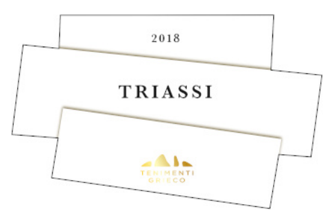
Triassi 2018 Tenimenti Grieco (Molise, Italy)

Pasta with mushrooms and fish, Sauteed white meat, Broiled fish, Legume soups