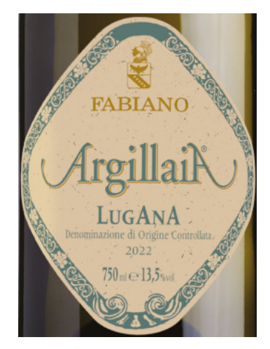
Lugana Argillaia 2022 Fabiano (Veneto, Italy)