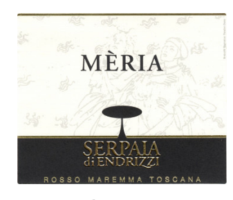
Mèria 2007 Serpaia (Tuscany, Italy)

Food match: Roasted meat, Stewed and braised meat, Broiled meat and barbecue, Hard cheese