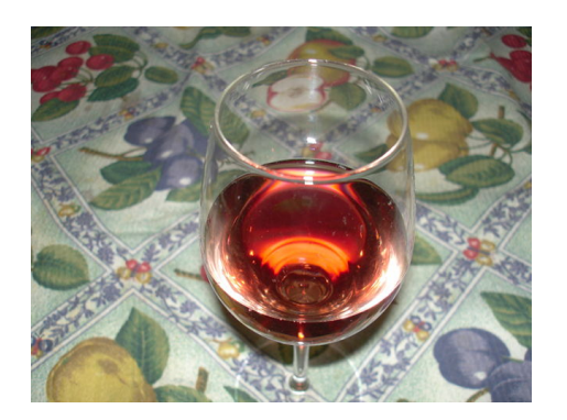
The color in mature rose wines, with time, turn into a pale orange hue

Besides the techniques expressly used for the production of rose wines, there is also another one which can be considered as a byproduct of the vinification of red wines. This particular technique is usually called with the French name saignée ,