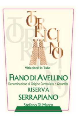
Fiano di Avellino Riserva Serrapiano 2021 Torricino (Campania, Italy)