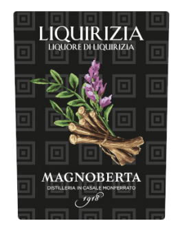
Liquirizia Magnoberta (Piedmont)

Review of Grappa, Distillates and Brandy