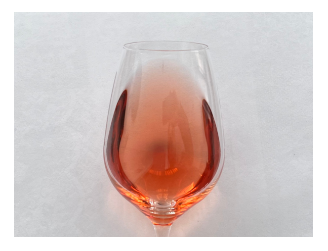
The color of Salice Salentino Rosato

Let's continue the tasting of the two wines of this month and