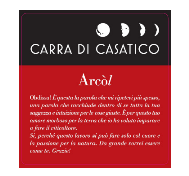
Arcòl 2017 Carra di Casatico (Emilia-Romagna, Italy)

Pasta and risotto with fish and crustaceans, Stewed crustaceans, Mushroom soups, Vegetable flans