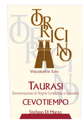
Taurasi Cevotiempo 2019 Torricino (Campania, Italy)