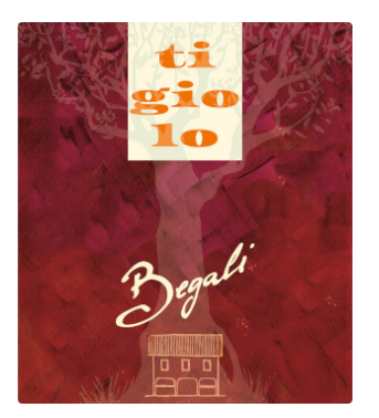
Tigiolo 2018 Begali (Veneto, Italy)

Game, Roasted meat, Braised and stewed meat with mushrooms, Hard cheese