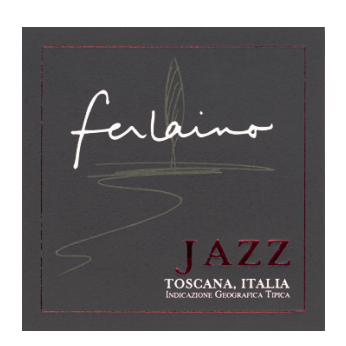
Jazz 2008 Ferlaino (Tuscany, Italy)

Food match: Piquant cheese, Confectionery, Dried fruit tarts