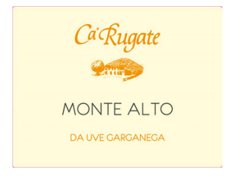
Soave Classico Monte Alto 2009 Ca' Rugate (Veneto, Italy)

Food match: Hard cheese, Confectionery, Dried fruit tarts