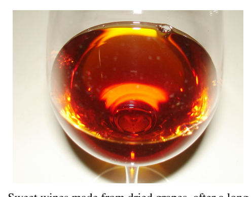
Sweet wines made from dried grapes, after a long aging in bottle, get a deep amber color

The most simple method consists in leaving the bunches on the vine and to wait for the natural drying of berries, therefore the grapes are being harvested. This technique is pretty common, however the most frequent one consists in harvesting ripe grapes - or, in many cases, overripe - and then laying the grapes over mats inside a room and to wait for their drying. Sometimes the drying of grapes is done not in mats but hanging them in wires on racks. The room used for the drying of grapes, when these two methods are being used, must have specific characteristics. Among the most insidious consequences of the drying of grapes, as well as being very frequent, is the developing of mold that, when it develops excessively, causes the damaging of berries and make them rot. For this reason, the room for the drying of the grapes must be well aerated in