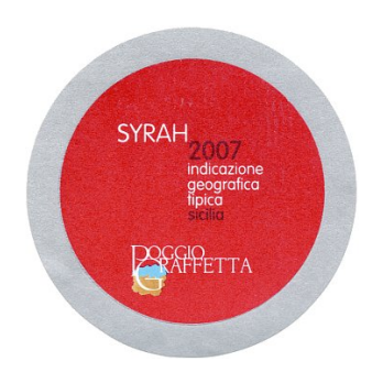
Syrah 2007 Poggio Graffetta (Sicily, Italy)

Food match: Roasted meat, Broiled meat and barbecue, Stewed meat