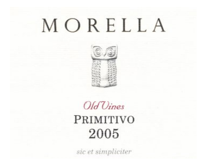
Primitivo Old Vines 2005 Morella (Apulia, Italy)

Food match: Roasted meat, Broiled meat and barbecue, Stewed and braised meat, Hard cheese