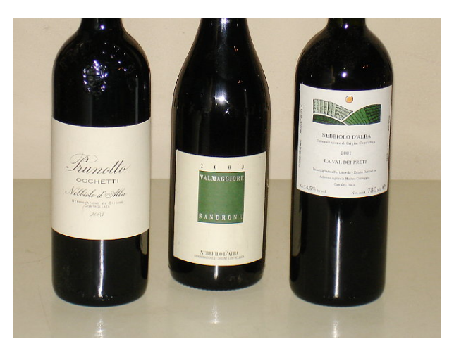
The three Nebbiolo d'Alba wines of our comparative tasting

All rights reserved under international copyright conventions. No part of this publication may be reproduced or utilized in any form or by any means, electronic or mechanical, without permission in writing from DiWineTaste. Inquiries should be sent to Editorial@DiWineTaste.com