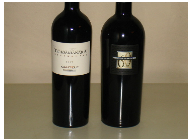
The Negroamaro and Primitivo of our comparative tasting

Primitivo has been the first grape of Apulia to go outside the borders of the region and to give notoriety to the wines of this area. For years it has been discussed about the origin of this renowned red berried grape. Many researches have allowed a better knowledge of Primitivo grape as well as discovering other varieties with genetic characteristic equal to the famous Apulian red, including Zinfandel, name with which Primitivo is known in the United States of America. These studies have also revealed