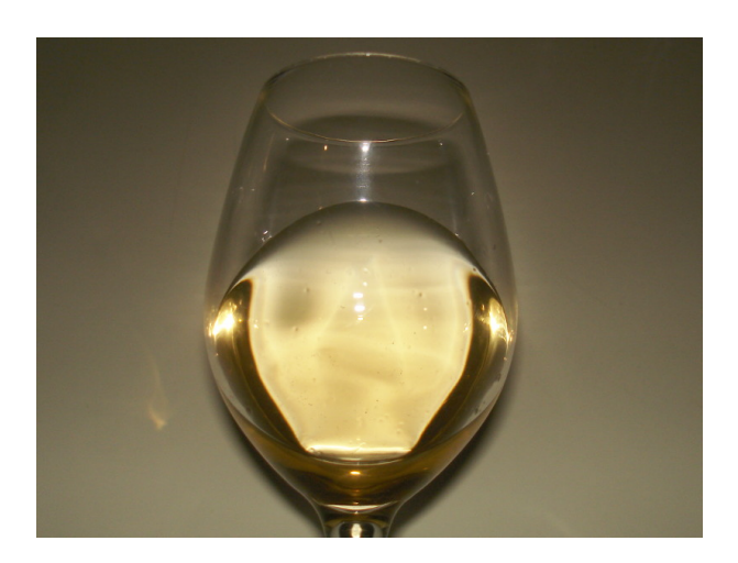
The intense color, almost golden yellow, of Fiano

by the sweetness of the juice of this variety and, for this reason, the grape was called vitis apicia . This name was later changed into Fiano, passing through apina , therefore apiana , then afiana and finally Fiano . To this variety was even dedicated the very first place in which vineyards of Fiano were historically planted in: Lapio, in province of Avellino, was in fact named after this ancient variety. Even today, Lapio has not lost its very ancient tradition and the cultivation of Fiano plays a fundamental role, as well as wine production, among the most significant lands of Fiano di Avellino.