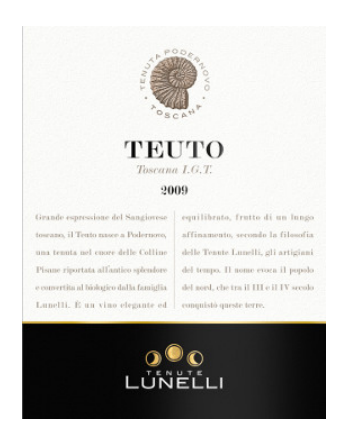
Teuto 2009 Tenuta Podernovo (Tuscany, Italy)