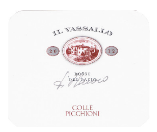
Il Vassallo 2012 Colle Picchioni (Latium, Italy)

Game, Stewed and braised meat, Roasted meat, Hard cheese