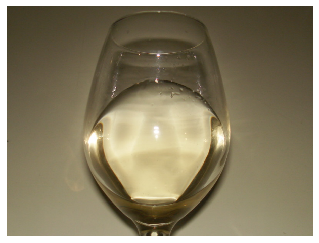
Riesling, as opposed to Fiano, shows a paler color with an evident greenish yellow hue

Let's start the tasting of the two wines from appearance analysis, a phase universally accepted by the many sensorial evaluation methods as the primary analysis in a wine. Differences will be evident by a simple observation of the two glasses, something which will emphasize the diversities in color nuances. Both wines have a high transparency - a typical characteristic in most of the whites - and this is the only common quality in the two wines. The color of Fiano shows, in general terms, a darker hue than Riesling. The famous Italian grape can in fact show