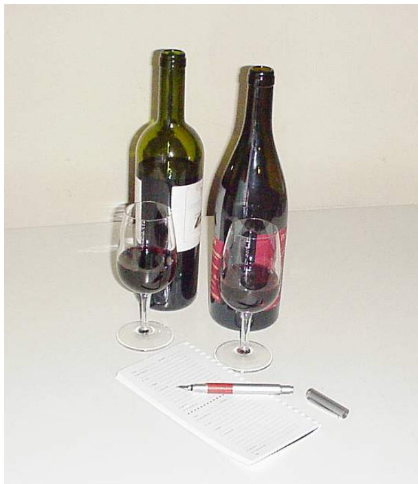
Bottles, glasses, a pen and a block notes - or a computer - everything you need to narrate a wine

A wine maker, for example, will be scarcely interested to the