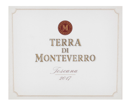
Terra di Monteverro 2017 Monteverro (Tuscany, Italy)

Cabernet Sauvignon (40%), Cabernet Franc (35%), Merlot (20%), Petit Verdot (5%)