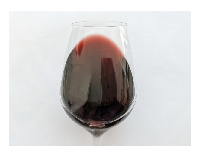
The color of Conero

Before starting this month's tasting by contrast between Alto Adige Pinot Nero and Conero, let's find the two bottles we will pour into the glasses. In both cases, finding the bottles is not difficult as they are wines which are well distributed and available in any wine shop. As Conero is in most cases aged in cask