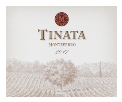
Tinata 2017 Monteverro (Tuscany, Italy)