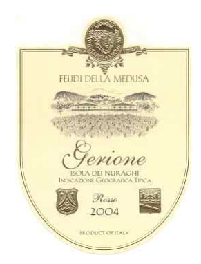
Gerione 2004 Feudi della Medusa (Sardinia, Italy)

Food match: Stuffed pasta, Roasted fish, Roasted white meat, Mushrooms soups