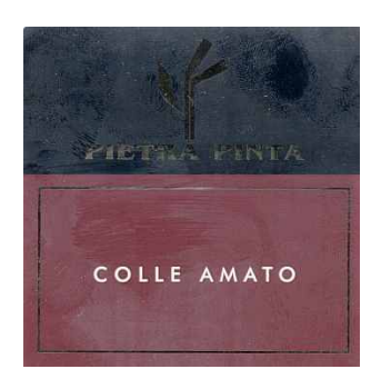
Colle Amato 2004 Pietra Pinta (Latium, Italy)

Food match: Broiled meat and barbecue, Roasted meat, Stewed meat