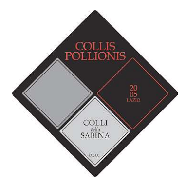
Collis Pollionis Rosso 2005 Tenuta Santa Lucia (Latium, Italy)

Grapes: Sangiovese (40%), Montepulciano (40%), Merlot (20%)