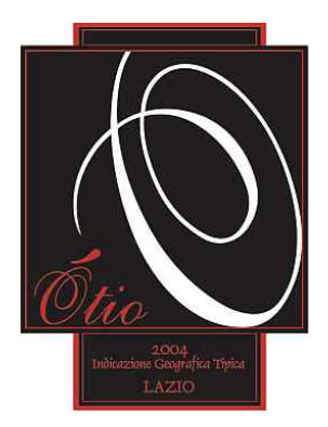
Otio 2004 Tenuta Santa Lucia (Latium, Italy)

Food match: Stuffed pasta, Cold cuts, Stewed meat