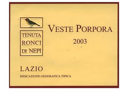
Veste Porpora 2005 Tenuta Ronci di Nepi (Latium, Italy)

Food match: Roasted meat, Braised and stewed meat with mush-rooms, Hard cheese