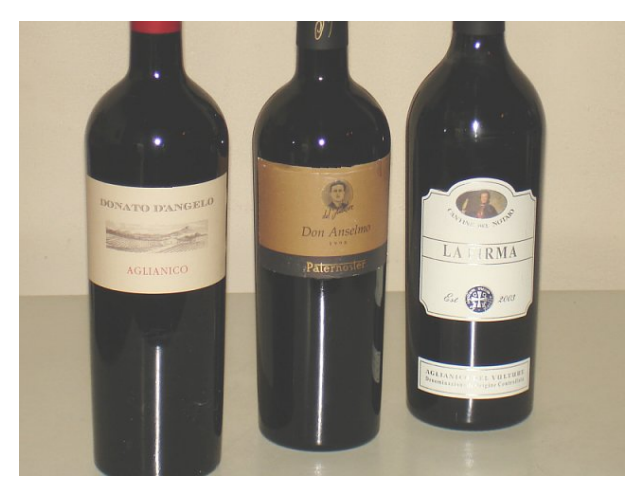
The three Aglianico del Vulture wines of our comparative tasting

Aglianico del Vulture is a wine with many aspects, with an interesting versatility most of the times expressed by pretty robust structures. Just like every other wine, wine making and viticultural practices used for the production of wines from Aglianico are important for quality and organoleptic characteristics. In the vast scenery of the production of this wine, there are in fact many expressions of Aglianico del Vulture, from average bodied wines and pretty "ordinary" organoleptic qualities, to full and robust bodied wines characterized by rich and complex organoleptic qualities. Thanks to its characteristics, Aglianico del Vulture is a wine which can be aged in bottle for many years, period during which will undergo a remarkable organoleptic evolution, tannins get rounder, therefore reaching an excellent balance. According to the production disciplinary, Aglianico del Vulture must age for at least 12 months in cask before being commercialized.