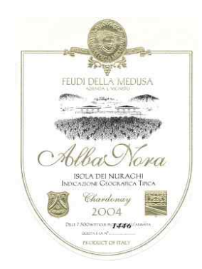
Alba Nora 2004 Feudi della Medusa (Sardinia, Italy)

Food match: Roasted meat, Braised and stewed meat with mush-rooms, Hard cheese