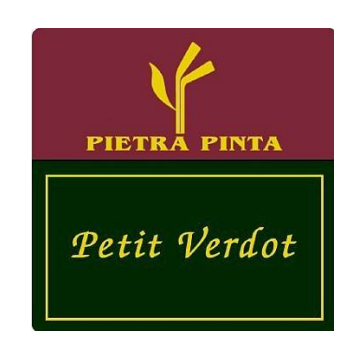
Petit Verdot 2005 Pietra Pinta (Latium, Italy)

Food match: Roasted meat, Stewed and braised meat, Hard cheese