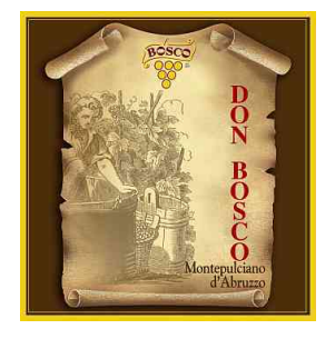
Montepulciano d'Abruzzo Don Bosco 2002 Bosco Nestore (Abruzzo, Italy)

Food match: Broiled meat and barbecue, Stewed meat with mush-rooms