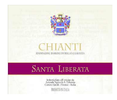
Chianti 2006 Santa Liberata (Tuscany, Italy)

Food match: Game, Roasted meat, Braised and stewed meat, Hard cheese