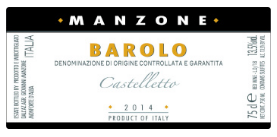
Barolo Castelletto 2014 Manzone Giovanni (Piedmont, Italy)

🚹 Dried fruit and jam tarts, Confectionery, Piquant cheese