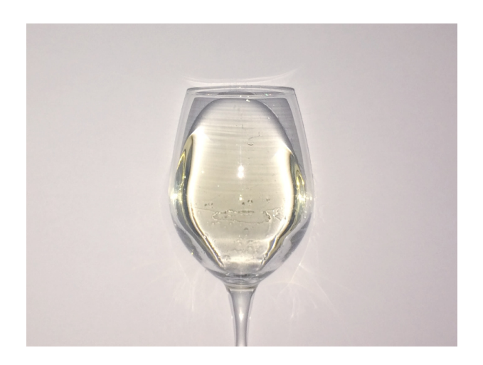
The color of Grüner Veltliner

Let's pour Grüner Veltliner and Timorasso into their respective glasses and begin the tasting by contrast of this month, taking into consideration the appearance of both wines. The first wine we evaluate is Grüner Veltliner. By tilting the glass over a white surface – for example a sheet of paper – and by observing the base of the glass, where the mass of the wine is thicker, let's evaluate color and transparency. We can see a brilliant greenish yellow color and a high transparency, allowing the perfect vision of the object eventually placed between the glass and the white surface. Let's now look at the edge of the wine, towards the opening of the glass, in order to evaluate its nuance: also in this case we notice an evident greenish yellow color. Let's move on to the evaluation of the appearance of Colline Tortoresi Timorasso and observe the wine at the base of the glass. The Piedmontese wine shows an intense straw yellow color, often tending to golden. Let's now look at the opening of the glass: the nuance of Timorasso confirms the