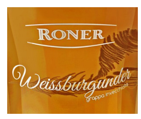
Grappa Weissburgunder Invecchiata Roner (Alto Adige)

Review of Grappa, Distillates and Brandy