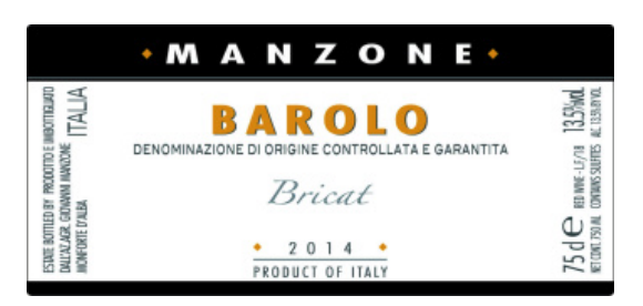
Barolo Bricat 2014 Manzone Giovanni (Piedmont, Italy)