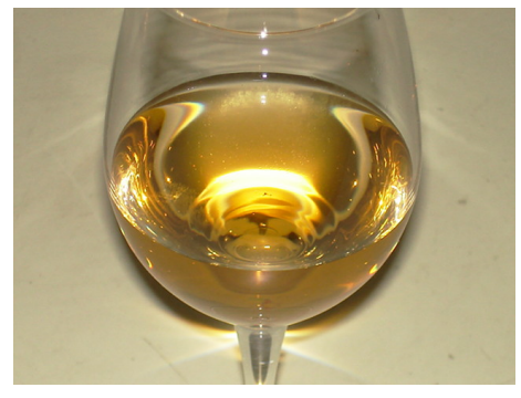
The aging in bottle gives mature white wines deeper and more intense colors, usually golden yellow or pale amber

Even though they are found in low quantity, when compared to red wines, tannins in white wine can be increased with specific wine making techniques. The most common way is to ferment, and later age, the wine in wood containers, while considering the quantity of tannins added to the wine is higher in case of the use of barrique than of large casks. The aging and fermentation of white wine in barrels favor the effect of oxygen - reaching the