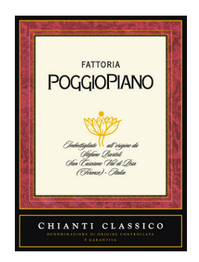
Chianti Classico 2008 Fattoria Poggiopiano (Tuscany, Italy)

Food match: Game, Braised and stewed meat, Roasted meat, Hard cheese