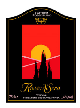
Rosso di Sera 2008 Fattoria Poggiopiano (Tuscany, Italy)

Food match: Pasta with meat, Broiled meat and barbecue, Stewed meat