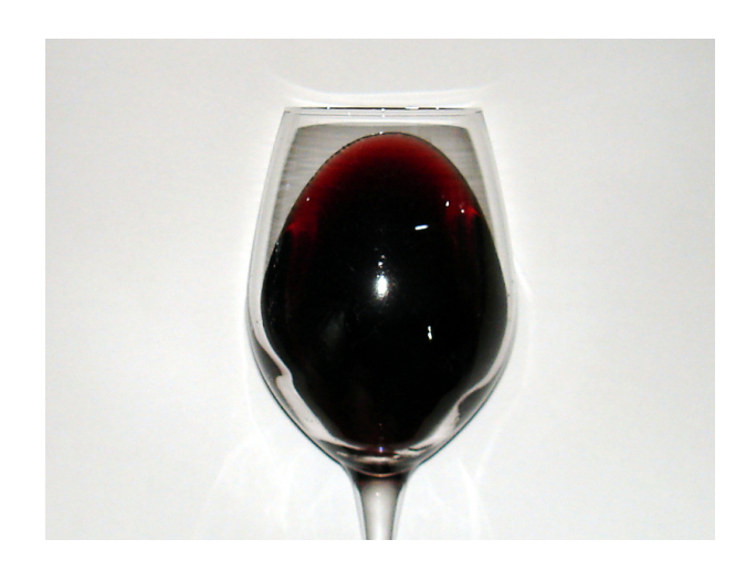
The color of Tannat

Let's pour the two wines into their respective glasses and start the tasting by contrast of this month, starting from the Stellenbosch Pinotage. The sensorial analysis of the wines begins with the evaluation of the appearance, for which we will need a white surface to be used for the observation of the glasses. Let's tilt the glass of the Stellenbosch Pinotage over the white surface and observe the wine at the base: we will notice an intense and brilliant ruby red color, with a rather low transparency, so that the object placed in contrast between the glass and the white surface is scarcely visible. The nuance of this wine, observed at the edge of the glass, towards the opening, confirms the ruby red color, often accompanied by evident purple shades. Let's now move on to the evaluation of the appearance of the Madiran, that is to the wine produced with Tannat, and let's tilt the glass over the white surface. The color of this wine is intense and dark ruby red, with a decidedly low transparency. The nuance of Tannat, observed at the edge of the glass, reveals a ruby red color in which can sometimes be