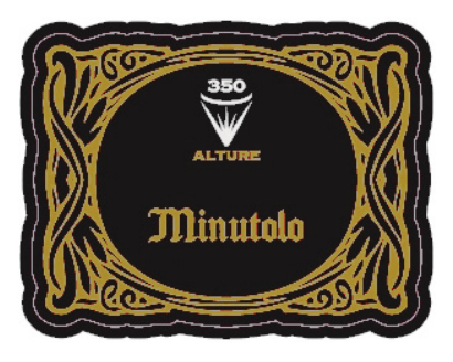
Alture Minutolo 2017 Paolo Leo (Apulia, Italy)

Prices are to be considered as indicative. Prices may vary according to the country or the shop where wines are bought