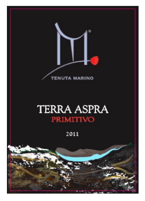
Matera Primitivo Terra Aspra 2011 Tenuta Marino (Basilicata, Italy)

Roasted meat, Stewed and braised meat with mushrooms, Hard