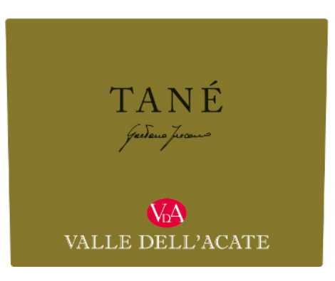
Tané 2011 Valle dell'Acate (Sicily, Italy)

🊹 Cold cuts, Pasta with meat, Sauteed meat, Fish soups