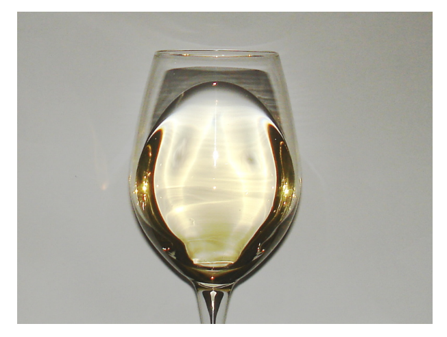
The color of Pinot Blanc

Our tasting by contrast starts with the evaluation of the appearance in both wines, let's therefore pour them in their respective glasses. The first wine of which we will evaluate color and