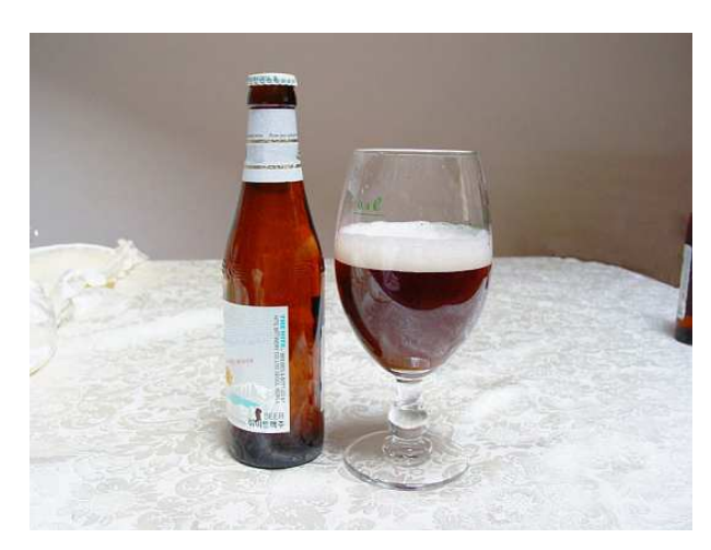
Beer is among the most ancient and common alcoholic beverages in the world

In the Middle Age the technique of brewing was developed and passed to monasteries where monks tried to refine and improve the production technique. Until then beer was aromatized with herbs and spices and monks were successful in dramatically improving the production technique by introducing hop. From hop it is being obtained a yellowish liquid having antiseptic, aromatic and preservative qualities which makes beer more aromatic and limpid.