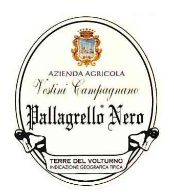
Pallagrello Nero 2002 Vestini Campagnano (Italy)

Food match: Braised and stewed meat, Roasted meat, Game, Hard cheese