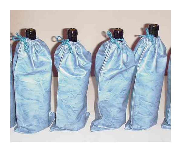
Blind tastings provide the best results

Becoming a good wine taster means, first of all, practicing a lot as well as keeping memory and senses well trained. This result can be obtained, obviously, by tasting as many wines as possible. Contrary to common belief, tasters do not assess exceptional or high quality wines only: in order to realize the magnificence of a wine it is also necessary to know - and recognize - its exact opposite, that is lesser quality wines. Every taster knows the educational and professional value offered by a faulty wine: it is a chance to learn to recognize them and sometimes faults in wine are so subtle which require a well trained nose in order to be detected. No matter this can be considered obvious and useless, it is good to remember a great wine is, first of all, a wine having no flaws. The capacity of recognizing faults and therefore the capacity of recognizing their absence, would suggest a concept expressed more than 2,500 years ago by Lao Zi in its famous Dao De Jing: «In the world everyone knows the beauty as beauty and therefore they realize ugliness; everyone knows the good as good and therefore they realize the evil». Such a consideration, even though it can be considered obvious, reminds about the importance of difference and comparison. Likewise great wines can be realized