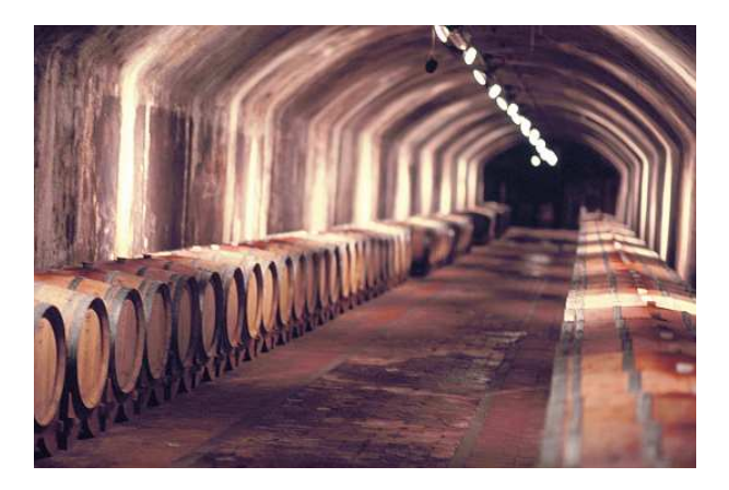
The wines aging cellar

an interesting cultural and receptive activity. The winery has dedicated to its most illustrious guest a literary prize "Giacomo Casanova Castello di Spessa" which is awarded to authors whose works are inspired by values of intellectual freedom, tolerance and cultural openness. In the "Casanova" conference hall are also held many artistic and cultural events and in the castle is also found a museum dedicated to the illustrious venetian figure of the eighteenth century. In the castle there is also a restaurant - Tavernetta del Castello - a hotel and apartments for guests who wishes to have a stay in complete freedom.