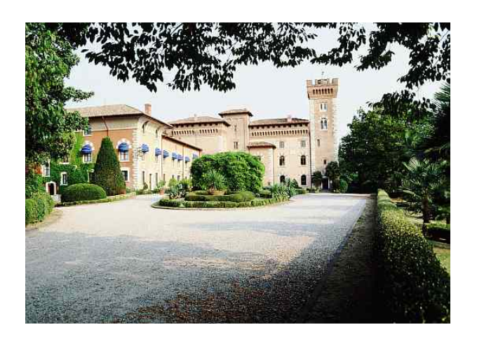
Castello di Spessa

The current look of Castello di Spessa is the result of a rebuilding done in 1881 by architect Ruggero Berlam from Trieste, pupil of Camillo Boito. It was not a restoration but a proper rebuilding done according to the architectural and artistic concepts of nineteenth century. Today Castello di Spessa - besides making excellent wines - is also involved in