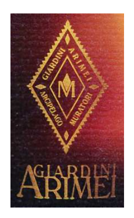
Giardini Arimei Muratori (Italy)

Food match: Stewed meat, Roasted meat, Broiled meat and barbecue