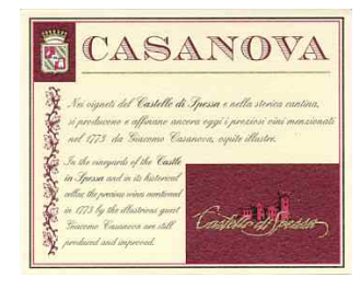
Collio Pinot Nero Casanova 2001 Castello di Spessa (Italy)

Food match: Broiled fish, Mushroom soups, Stuffed pasta with vegetables, Risotto with crustaceans