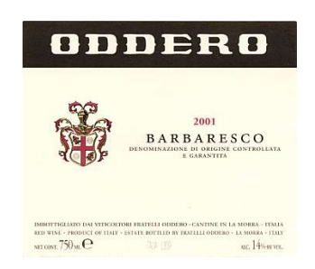
Barbaresco 2001 Oddero (Italy)