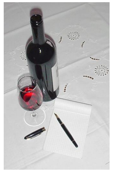
Taking notes during tasting is useful for improving the taster's capacities

In group tasting a good system is to have two persons doing this operation. The first person, without being seen by others, will put bottles in bags, uncorked and without capsules. The second person, once again without being seen by others, will shuffle the original order of bags and then will assign an identification number on each of them. In case the tasting is done by just one person, it can be asked someone to put bottles in the bags and to number them. The room chosen for the tasting must be sufficiently enlightened and possibly well aerated as well, there must not be any extraneous smell, such as in case of kitchen after its usage. Participants will not smoke, both for not compromising their sensorial capacities and, in particular, for not spoiling the air in the room. For the same reason, it