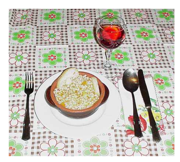
Rose wines offer very good possibilities in food matching

conviction they are produced by blending white and red wines together. To tell the truth this conviction is the result of a deprecable habit of restaurateurs and producers who in the past, with no scruple - as well as with no intelligence - were used to blend whites and reds in order to create a terrible pink colored wine.