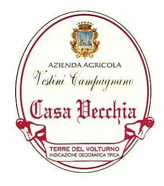
Casavecchia 2002 Vestini Campagnano (Italy)

Food match: Roasted meat, Stewed and braised meat, Hard cheese