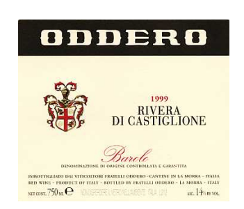
Barolo Rivera di Castiglione 1999 Oddero (Italy)

Food match: Roasted meat, Braised and stewed meat, Hard cheese