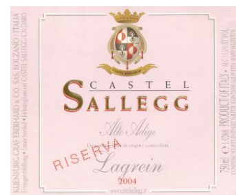
Alto Adige Lagrein Riserva 2004 Castel Sallegg (Alto Adige, Italy)

Food match: Vegetable soups, Broiled crustaceans, Sauteed crustaceans, Risotto with crustaceans