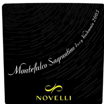
Montefalco Sagrantino 2005 Cantina Novelli (Umbria, Italy)

Food match: Vegetable soups, Pasta and risotto with fish and mushrooms, Stewed fish