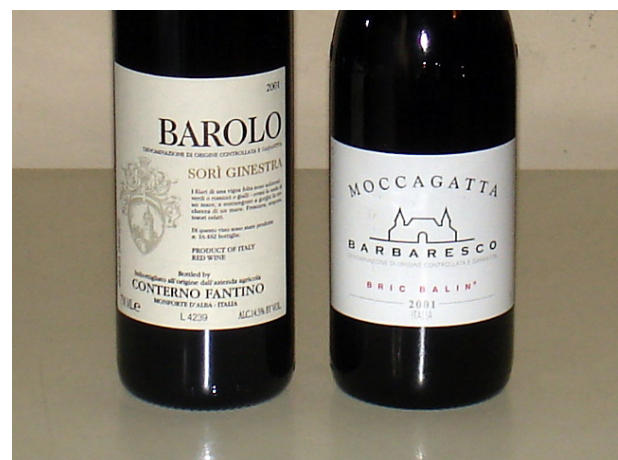
Conterno Fantino's Barolo Sorì Ginestra and Moccagatta's Barbaresco Bric Balin of our comparative tasting

King of wines, wine of the kings. About Barolo has been written and discussed a lot, it received in the course of the years the highest praises and the highest honors, it is one of the best representatives of Italian enology in the world. Barolo is generally defined as a "masculine" wine, because of its strong and