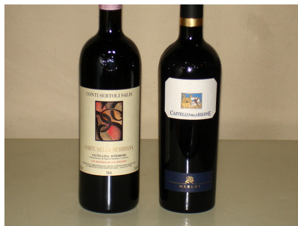
The Nebbiolo and Merlot of our comparative tasting

Merlot certainly is one of the most famous grapes in the