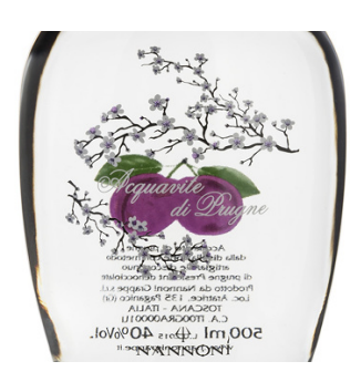
Acquavite di Prugne Nannoni (Tuscany)

Review of Grappa, Distillates and Brandy