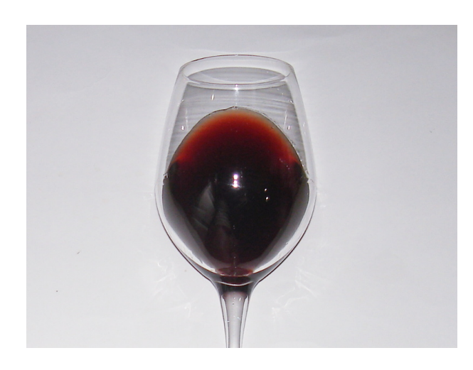
The color of Castel del Monte Nero di Troia

After having poured the wines in the glasses, we can start the tasting by contrast from the appearance, that is color, nuances and transparency. The first wine we will examine is Rossese di Dolceacqua, by observing the color at the base of the glass and holding it tilted over a white surface. The wine from Liguria shows a brilliant ruby red color and if we put an object between the glass and white surface, we will notice a moderate transparency. Nuances, observed at the edge of the glass towards the opening, reveal a ruby red color, sometimes having a light hue. Let's now pass to the evaluation of the appearance of Castel di Monte Nero di Troia, also in this case by holding the glass tilted over a white surface. The Apulian wine shows an evidently more intense and deep color than Rossese and transparency, by putting an object behind the glass, is evidently lower. Nuances of the wine produced with Uva di Troia, observed at the edge of the glass, where the wine is thinner, shows an intense ruby red