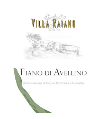
Fiano di Avellino 2016 Villa Raiano (Campania, Italy)